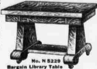
No. N 5229 Bargain Library Table

Simply ask for our big, new, free catalog and we will open an account for you on our books. You do not need to bring us any money. You are not asked to give a note, chattel mortgage or anything of the kind. We charge no interest. We send no collection and there is no red tape or delay of any kind. Our credit plan is just the same kind of credit your grocer or meat man might allow you, only we give you so much longer time to pay and we do not ask for it all in one bunch—just a little at a time, monthly.