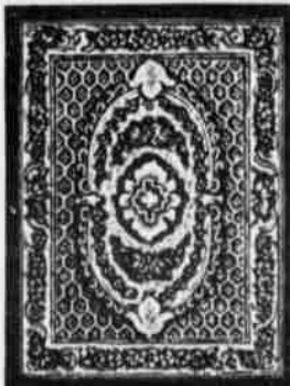
Kremlin Wilton Velvet Rug

Remember, there are over a million families—rich and poor—who buy all their home furnishings from us on this great easy-payment plan. We save these families from 15 to 50 per cent, as every item listed in our big, handsomely illustrated catalog is a bargain in every sense of the word. Our years of experience and our tremendous capital enable us to take advantage of amazing dull season opportunities to buy and manufacture the finest merchandise in the world at figures so low that we can sell direct to you on credit at even a much lower price than the retail dealer in your town could buy them at wholesale.