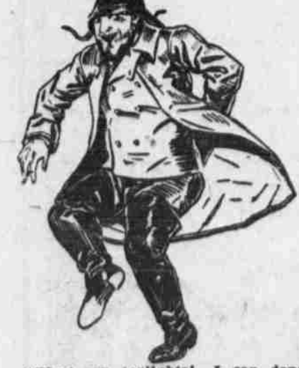
"Blast my toplights! I can dance the horspipe as well as if I'd never been ruptured?"

If Ca bed-rid means not you sult by much, seafare he oper be operated upon or die. Yet he cured himself absolutely and his big, free book tells how.