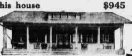
This house $945