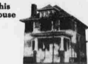
This house $1088