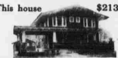
This house $2133