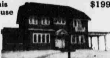
This house $1995