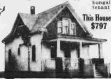
This House $797

The quality of all material is far superior to the average—clear siding, clear flooring, clear interior finish, clear shingles. "Clear" means free from knots or any defects—the best that grows. The same grades of lumber go in every Aladdin house. The price includes all framing lumber cut to fit; siding cut to fit; sheathing cut to fit; flooring cut to fit; all outside and inside finish cut to fit; windows, frames, casings, stairways, glass, hardware, locks, nails, paint and varnish for the outside and inside, shingles, plaster board for all rooms or lath and plaster, complete instructions and illustrations for erection, eliminating the necessity of skilled labor—a complete house. Aladdin construction passes successfully the strictest regulations of the big cities. This means they are built according to the most approved building laws. Our big 100-page catalog contains dozens of beautiful dwelling houses and bungalows—it tells the complete story. Summer cottages, farm buildings, barns, garages, tenant houses, etc., are shown in special catalogs. SEND TODAY FOR CATALOG No. 2.