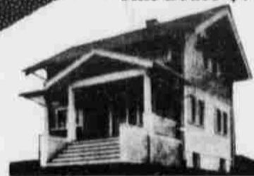
This house $797

22 Aladdin Avenue, BAY CITY, MICHIGAN Canadian Branch: Sovereigns Construction Co., C. P. R. Bldg., Toronto, Can. Remember the "Dollar-a-Knot" Quality Guaranty