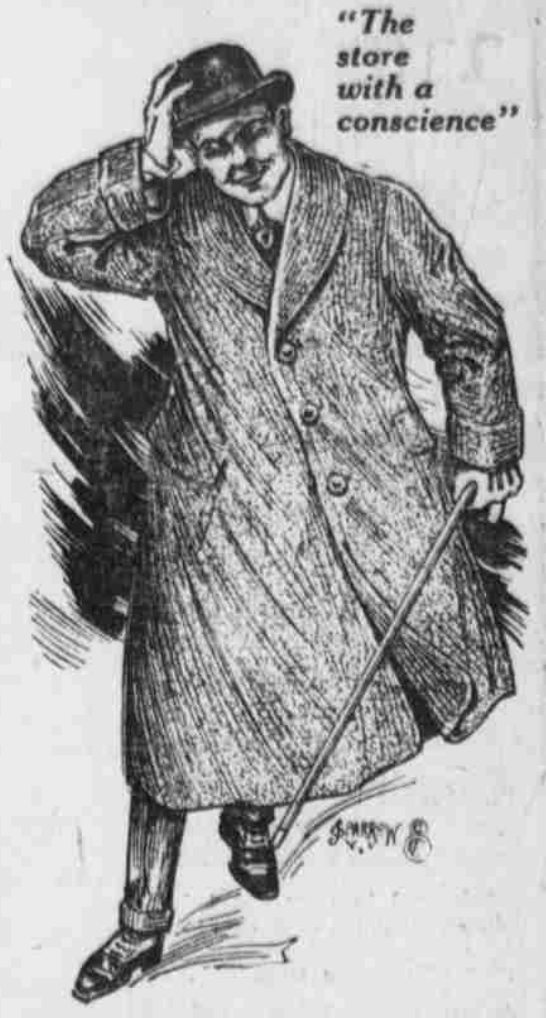
"The store with a conscience"