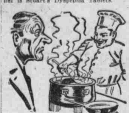
The Dyspeptic: "How can a man live in a small like that?"

All the world has to eat. You men who walk to your meals like you do to a drug store for medicine, should at one realize that there is a relief for you. This relief is Stuart's Dyspepsia Tablets.