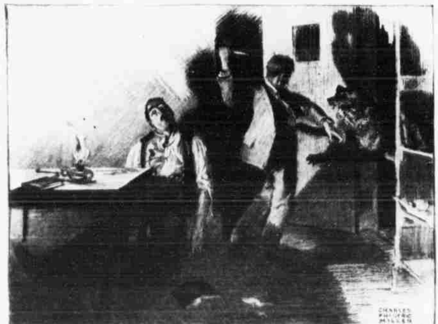
As the dog launched for his throat he struck straight and hard

When he struggled up, the moon came out brighter than ever and by its light he saw that he had fallen close to a group of buildings, one of which seemed rather imposing. Stealthily he began to move away. But at his first step a sudden clamor broke out