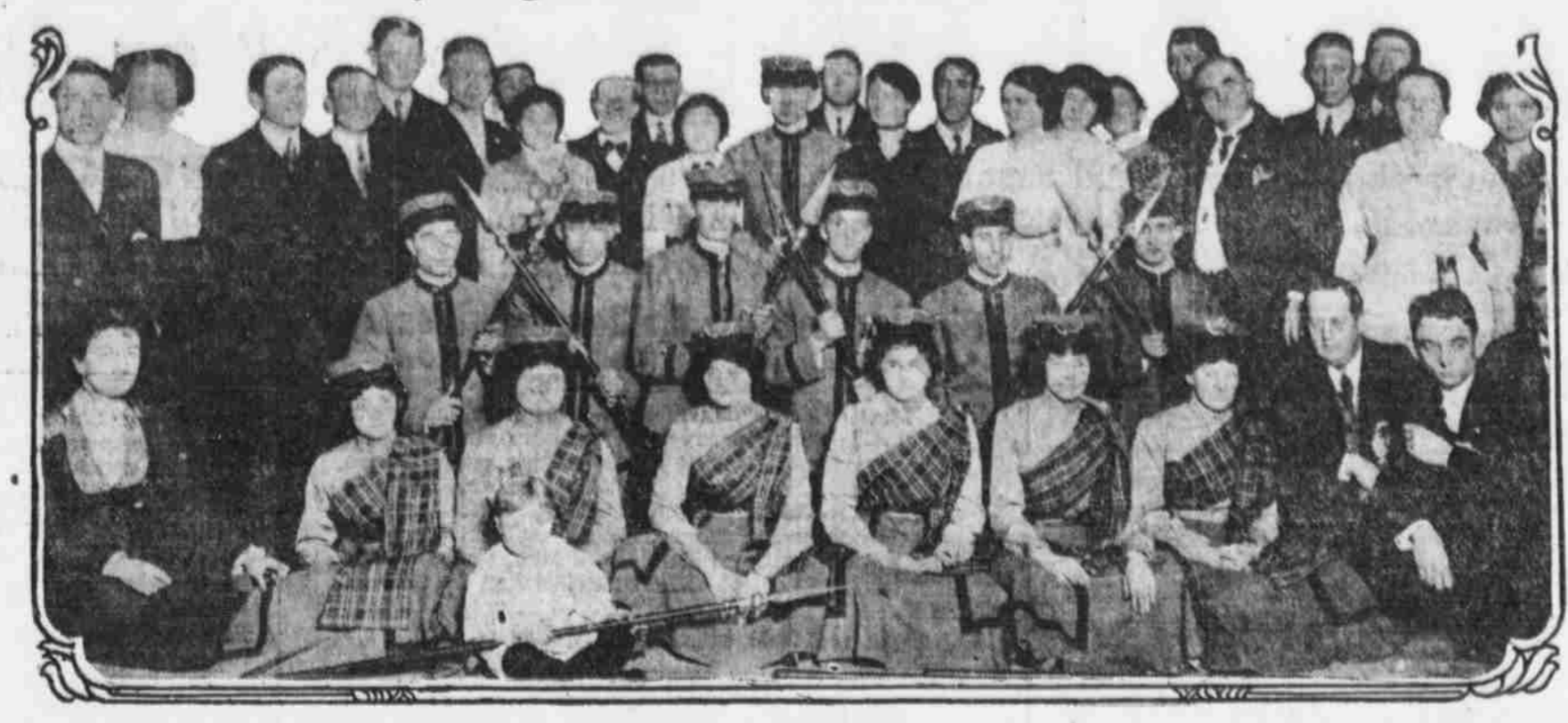
Four castles of the Royal Highlanders held a joint installation of officers Wednesday evening at Mackie's hall, 3151 Harney street.