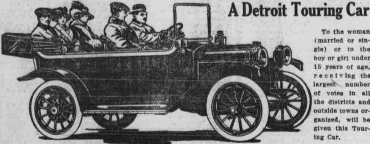
A Detroit Touring Car

To the woman (married or single) or to the boy or girl under 15 years of age, receiving the largest number of votes in all the districts and outside towns organized, will be given this Touring Car.