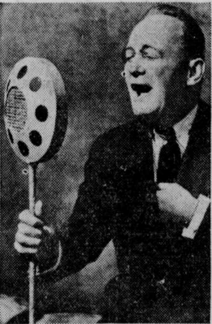
President Roosevelt in what is called one of the most daring satirical performances ever presented on the stage—"I'd Rather Be Right." The play opened in Boston recently.

Forsaking his usual American flag, George M. Cohan waves a microphone as he portrays a typical fireside address while burlesquing