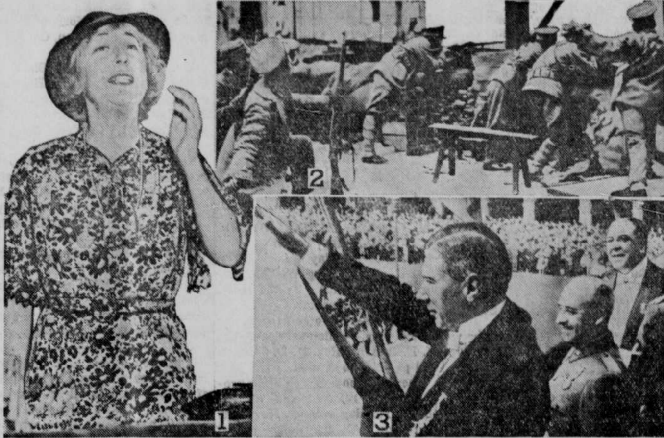
1—Miss Jeanette Rankin, former congresswoman from Montana and now associate secretary of the National Council for the Prevention of War, pictured as she addressed a meeting of the body recently and pleaded for American aloofness from foreign disputes. 2—Defenders of Shanghai repelling a Japanese attack on the city. 3—Herr Von Stohrer, newly appointed German ambassador to the insurgent government of Spain (left), shown as he acknowledged cheering crowds at Salamanca, Spain, with the Nazi salute. General Franco, who received the new envoy's credentials, is shown at his right.