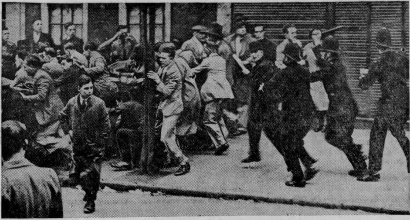
Police dispersing a crowd in London, where the recent attempt of Sir Oswald Mosley to lead a parade of 2,000 Fascist followers to a mass meeting provoked some of the worst street fighting involving Fascists and anti-Fascists since the general strike in 1926. Thirty persons were sent to hospitals suffering from head wounds and scores of others were treated for minor injuries in their homes.