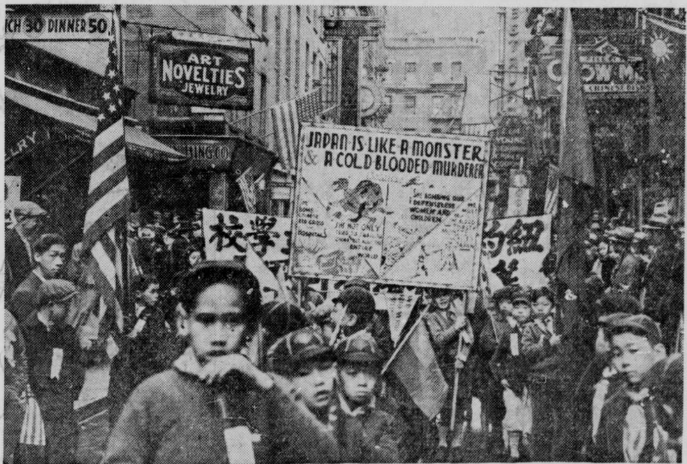
Chinese boy scouts marching along Mott street in an anti-Japanese demonstration in which the inhabitants of New York's Chinatown participated, in a drive for funds to aid war refugees. The boys are carrying a huge banner which relates: "Japan is like a monster and a cold-blooded murderer." Another rallying cry for donations was "Every penny kills a Jap."