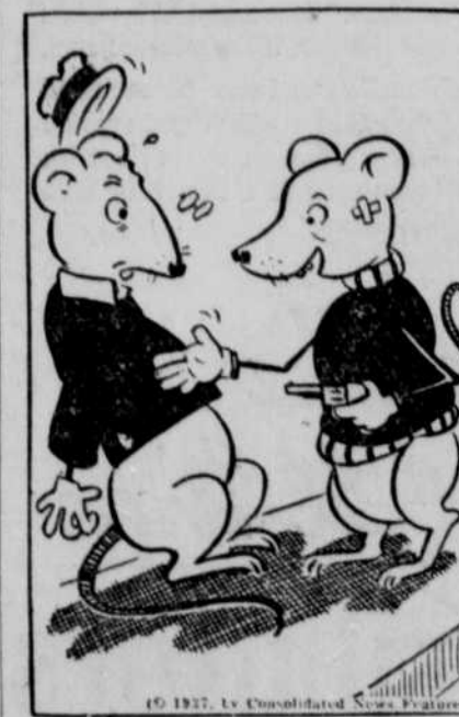
"Shake hands with Rodney the Rat. I don't accept things from strangers."