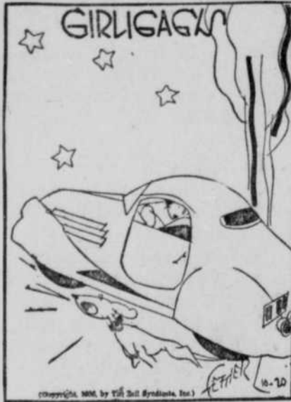
"Few auto drivers," says flivvering Flo, "live to admit their mistakes."

his mind to rush out and try to catch Jumper where he sat a heavy step sounded behind him. Reddy turned his head hastily. There was the big black stranger who had come to live in the Green Forest. Reddy didn't need to be told that it was Buster Bear. He gave one hasty look at the great claws on Buster's feet and then with a yelp of fright he tucked his tail between his legs and started for home as fast as he could run, the most frightened fox who ever ran through the Green Forest.