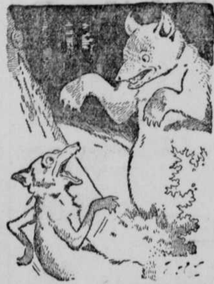
Reddy Didn't Need to Be Told That It Was Buster Bear.

all the little people who live in the Green Forest, had offered to go look for Buster Bear. Reddy Fox didn't believe that Jumper really would dare do it, but if he should why Reddy knew that everybody would say that he was a greater coward than Jumper, and would laugh at him ever after. There was just one thing to do and that was to give Jumper such a fright that he would forget all about Buster Bear. So as soon as he was out of sight of the other little people Reddy had turned into the Green Forest and run as fast as ever he could to head off Jumper the Hare.