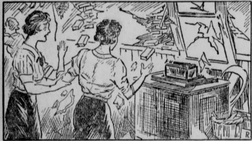
A Tottering Wall Fell With a Crash.

In the office, there was a moment of tense silence. Then Alberta heard the voice of her boss saying: "My God! An earthquake! San Francisco all over again!" Alberta took a quick look around the of-