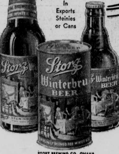
STORZ BREWING CO. OMAHA

These fall days call for a hearty beer that warms you. Storz Winterbru is made by Storz own special brewing process. The formula and method of brewing are different from those used in "summer" beers and Winterbru is "Slow Aged" weeks longer than ordinary winter beers.