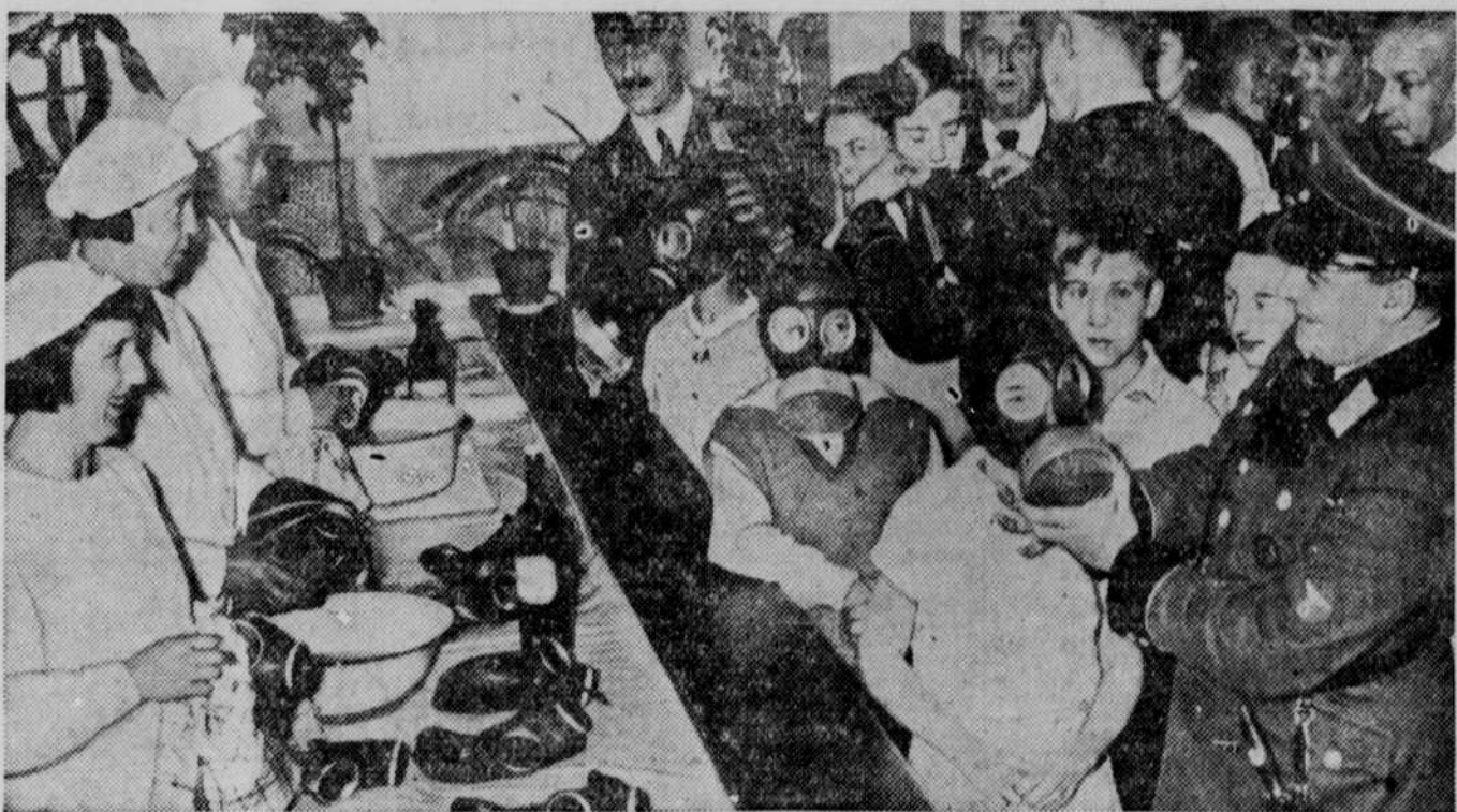
Berlin.—With war becoming more and more imminent in Europe, Germany hastens to protect her youth from the most horrible of modern weapons—gas. As pictured here, officials oversee the distribution of gas masks, making sure they fit properly before the youngsters are allowed to take them home at 2½ marks (about $1) the copy.