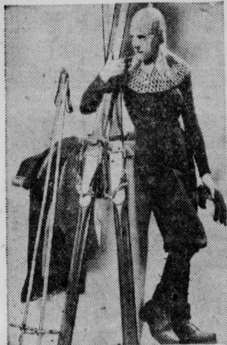
boyish knee pants are held at the back with buckle and strap. The "shocking pink" helmet is hand-knitted. A short jacket and long, loose coat complete the ensemble.

Paris.—Weird, but fashionable, is this ski addict, clad in Schiaparelli's latest outfit made of black wool and previewed at a Parisian salon. The