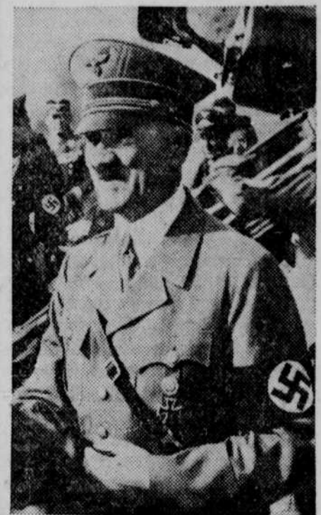
on his arrival at Nuremberg, Germany, to attend the National Socialist congress.

Dressed in a faultless uniform, Chancellor Adolph Hitler is greeted