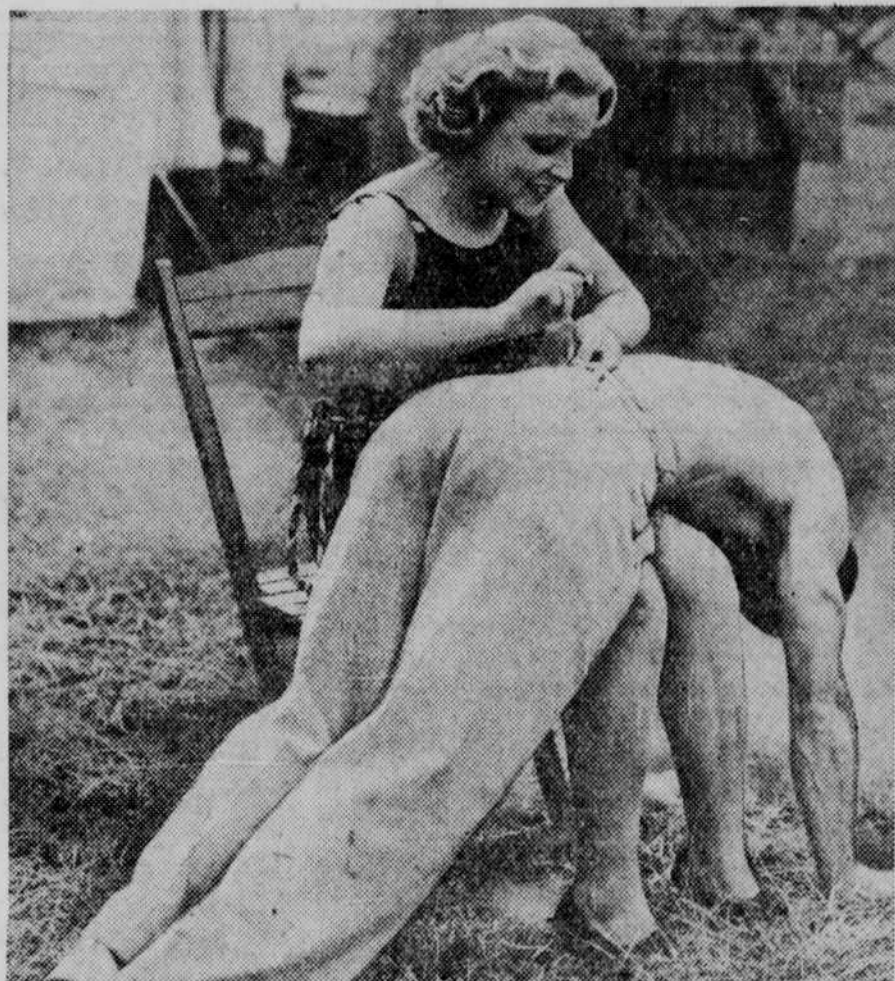
But what if the needle should slip? This snapshot was taken at a holiday camp on the Kent coast in England, where the fair needlewoman obliged her unlucky companion.