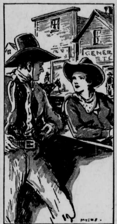
"Billy, don't! Can't we be friends?"

Outside, Horse Dunn turned to Billy Wheeler. "Guess you better get Marian. This here's the part I want her to see." Marian was waiting in the side street to which Horse Dunn had sent her with his car; and to the grim weariness of Billy Wheeler, Val Douglas was there, helping her wait. Wheeler walked to the door of the car, a tall, narrow-hipped figure, with a deceptively lazy stride. "We're starting now," he said. "You run on, Val," Marian said; "I want to talk to Billy." "Sure, hon." The wagon boss shot Wheeler a glance like a straight