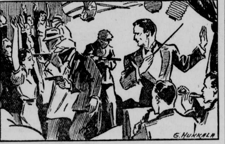
Just as Nero fiddled when Rome burned.