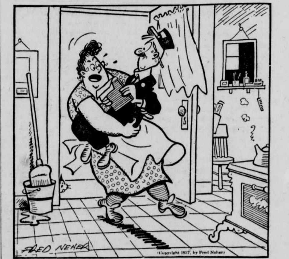
"No gas man is going to track up my clean linoleum!!"