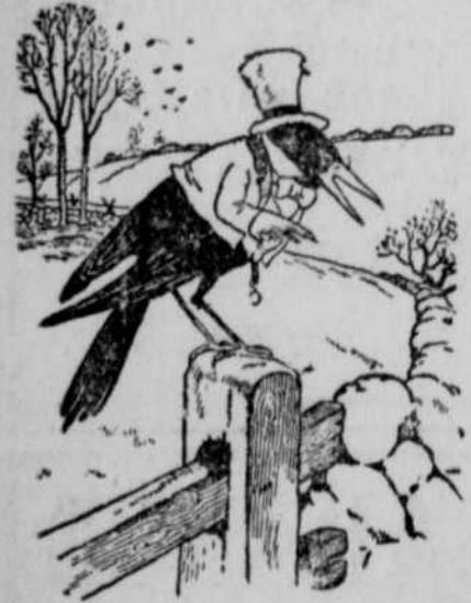
Blacky the Crow Was Cawing It From a Fence Post on the Edge of Farmer Brown's Cornfield.

Wake up, wake up, you drowsy heads! Wake up, wake up, and leave your beds! The gladder time of all the year has come, for Mistress Spring is here! CHEERFUL Robin was singing it up in the Old Orchard. Little Friend the Song Sparrow was singing it down along the edge of the Laughing Brook. Winsome Bluebird was whistling it from the top of the Big Hickory over by the Smiling Pool. Blacky the Crow was cawing it from a fence-post on the edge of Farmer Brown's cornfield. Danny Meadow Mouse was shouting it in a funny little squeaky voice down on the Green Meadows.