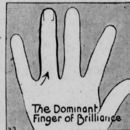
The Dominant Finger of Brilliance

QUITE the opposite of the individual whose creative ideas and urges must be keyed to an impossibly high ethereal plane are those men and women whose creative faculties are so practical that they are often mistakenly credited with having no creative impulses at all. Yet to these intensely creative folk the world owes some of its most outstanding advances of government, industry and commerce.