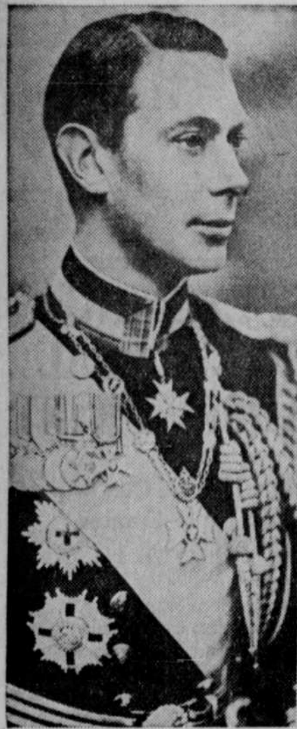
King George VI.