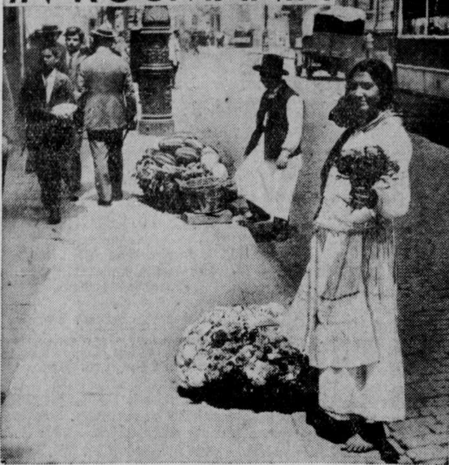
Gypsy Girl on a Bucharest Street.

Prepared by National Geographic Society, Washington, D. C.—WNU Service.