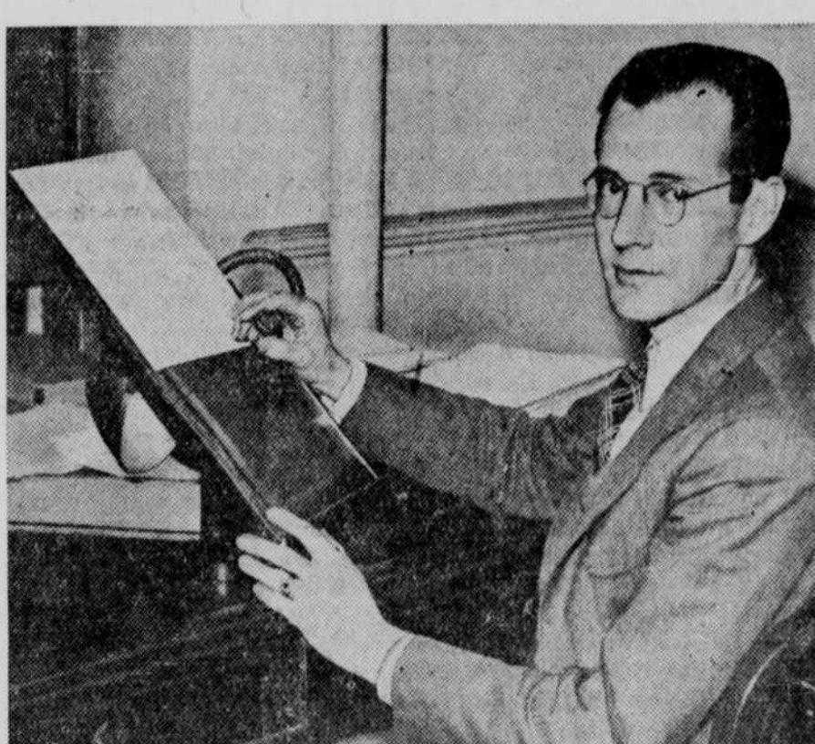
Dr. Fred L. Whipple, of the Harvard observatory, who announced recently the discovery of a new small comet in the constellation Canes Venatici (the hunting dogs), is shown in his office at Harvard university, checking over negatives made at night of the stars. The comet, which has a tail about "one degree long" and is of the twelfth magnitude, was discovered by the astronomer when he examined a photographic plate he had taken.