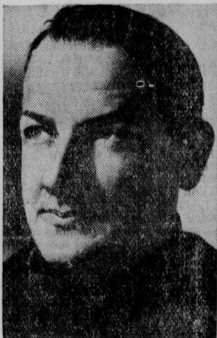
A recent photograph of Vice Premier Valery Ivanovitch Mezhlauk, who has been appointed to the post of commissar of heavy industry of the U. S. S. R. to succeed Gregory K. Ordjonikidze, who died recently. Mezhlauk is well known in the United States, having traveled extensively about industrial centers here.