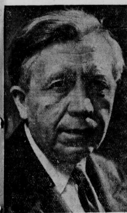
A new distinction for variously distinguished Vilhjalmur Stefansson, world famous American explorer, scholar and author, was his recent election as president of the Explorers' club, New York. Renowned for his many expeditionary studies of Arctic archeology, anthropology, ethnology and geography during the past quarter-century, Stefansson holds degrees, medals and other high honors.