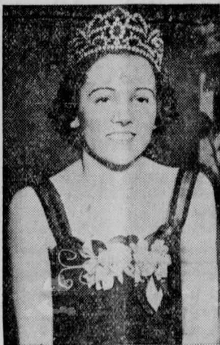
a charity ball at Northwestern university, Evanston, Ill., recently. Collegiate beauties from every university in the Big Ten except Michigan competed in the marathon.