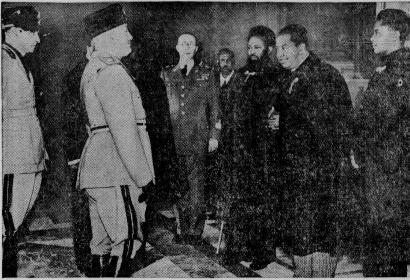
Ras Seyoum, fiercest of the Ethiopian warrior chieftains during the recent Italo-Ethiopian war, is graciously received in Rome, by Premier Benito Mussolini. The dignified, bearded chief is now a peaceful friend of Italy, offering good advice, unofficially, from his Addis Ababa home.