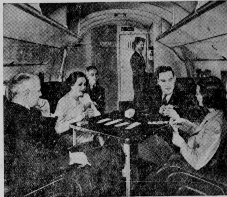
Swivel chairs for a bridge foursome are one of the features of the new air liner recently placed in operation between Chicago and New York by the United Air Lines. Making a non-stop flight schedule of three hours and fifty-five minutes, the plane features air conditioning, steam heat, hot meals and a telephone from the stewardess' galley to the pilot's cockpit.