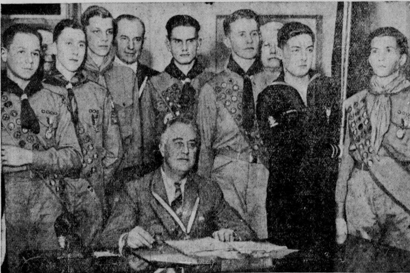
Surrounded by Eagle Boy Scouts, President Franklin D. Roosevelt broadcasts a message to a million Boy Scouts as the twenty-eighth year of the U. S. scout movement opens. By virtue of his office, the President is honorary president of the national scout organization. He has been an active leader in scouting for 15 years.