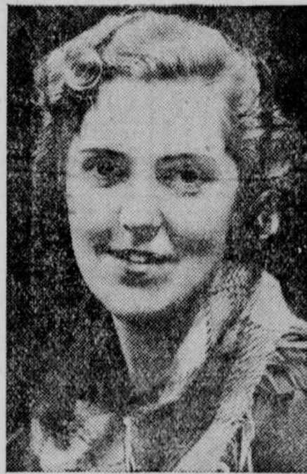
Miss Prunella Stack, twenty-two-year-old leader of the Women's League for Health and Beauty, of London, who has been invited by Prime Minister Stanley Baldwin to serve on the national advisory council which will draw up plans for the national college of physical training.