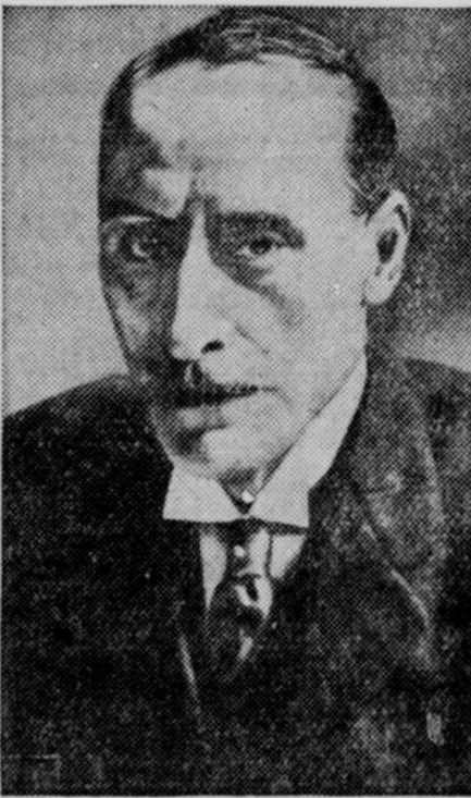
The earl of Lancaster, whose appointment as lord great chamberlain, succeeding the marquess of Cholmondeley, who relinquished the office following the abdication of King Edward VIII, was approved recently by George VI.