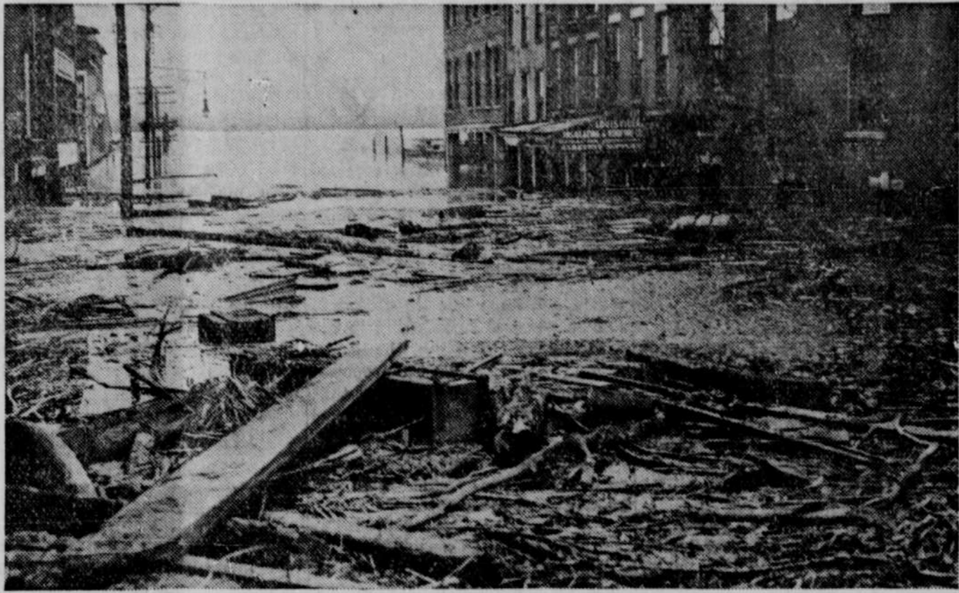
Scene in a Cincinnati street after the turbulent waters of the Ohio had receded. Rubble carried by the swollen river for hundreds of miles was left high and dry on city streets when the crest of the flood passed on, leaving scenes of ruin in its wake.