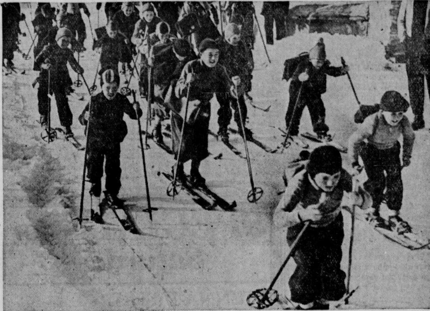
One day each week the school children of the little town of Iglis in the Austrian Tyrol must take a compulsory skiing lesson, under the instruction of famous skiers. Here starting out on a skiing lesson are a group of youngsters. Judging from the smiles on their faces and their enthusiasm, this is one class they thoroughly enjoy.