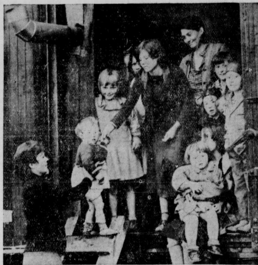
Box car home of flood refugees driven from their farm homes near Ridgely, Tenn., by the flood waters of the raging Mississippi. With all the discomfort and suffering caused by the greatest flood in the history of the Ohio and Mississippi valleys, these flood victims could still smile.