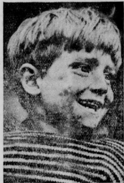
This youngster found a temporary home in a box car when the Mississippi river, flood drove him from his own home. He took flood discomfort in his stride. One thing that may account for his obvious high spirits was the fact that water shortage eliminated his Saturday night bath and the daily scrubbing behind the ears. It was estimated that more than 1,000,000 people in the Ohio and Mississippi valleys were rendered homeless by the flood. The known dead were estimated in excess of 400. Contributions by citizens everywhere to the special relief fund of the Red Cross were more than $17,000,000. The storm's damage was estimated at close to a billion dollars.