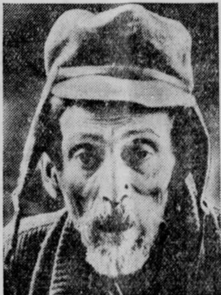
This aged inhabitant who fled the rich Mississippi bottom lands in the face of the raging flood waters of "O' Man River," has a startled stare for the photographer who snapped him at his refugee camp in Memphis.