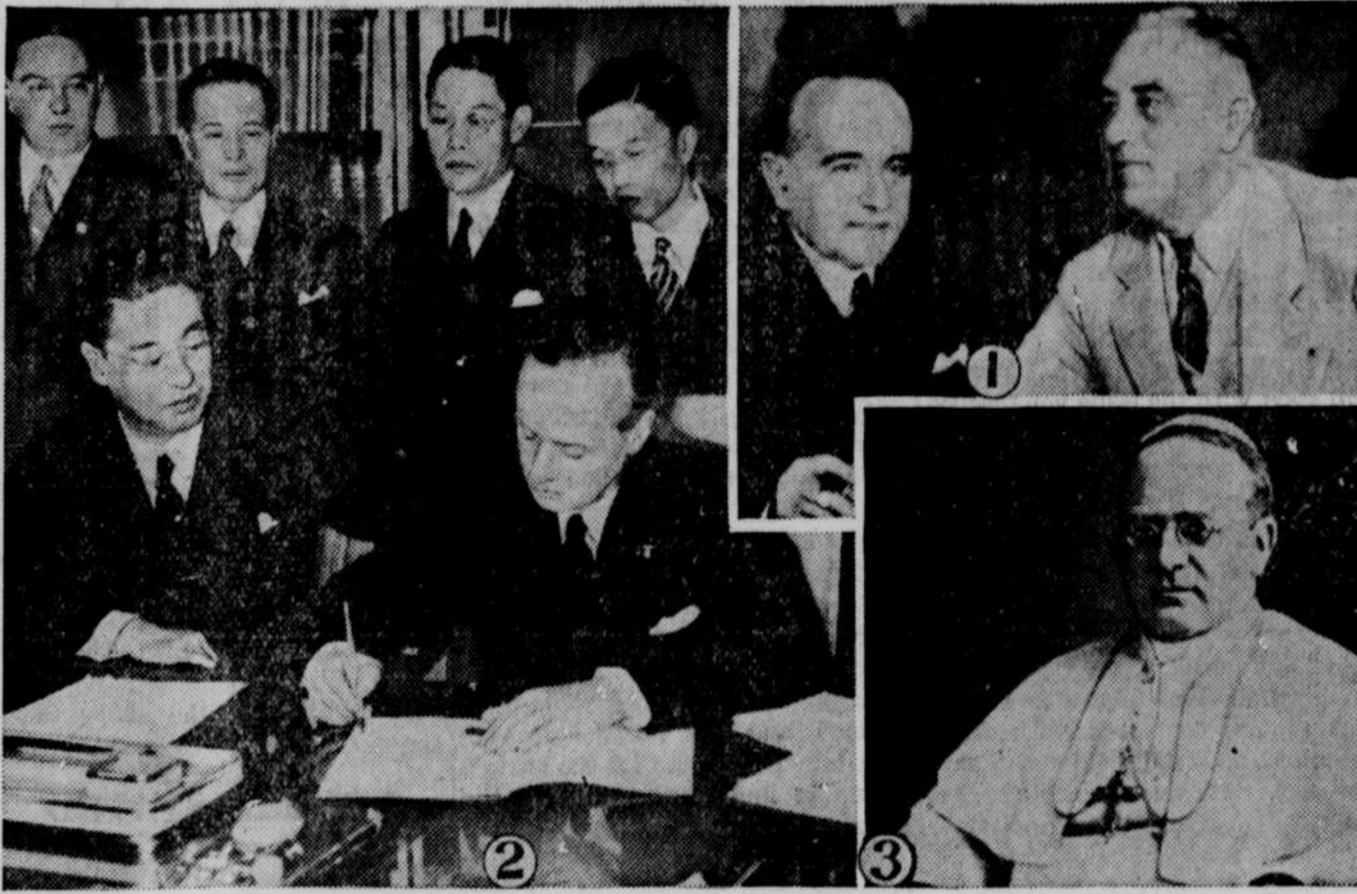
1—President Roosevelt shown as the guest of President Vargas of Brazil on his recent South American tour. 2—German and Japanese diplomatic representatives in Berlin signing treaty agreeing to combat communism, an action which Russia believes is aimed at the Soviet government. 3—Portrait of Pope Pius XI made before his illness.