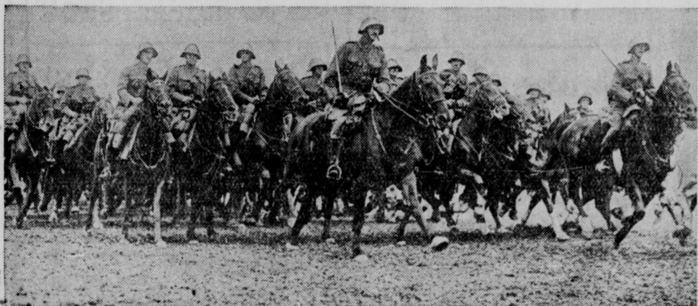
Impressed by growing armies, navies and air forces of the nations that border it, Switzerland is not to be caught napping by a sudden invasion. Its tiny, but well trained military force is put through periodic paces such as the above cavalry drill during maneuvers recently, near Geneva.