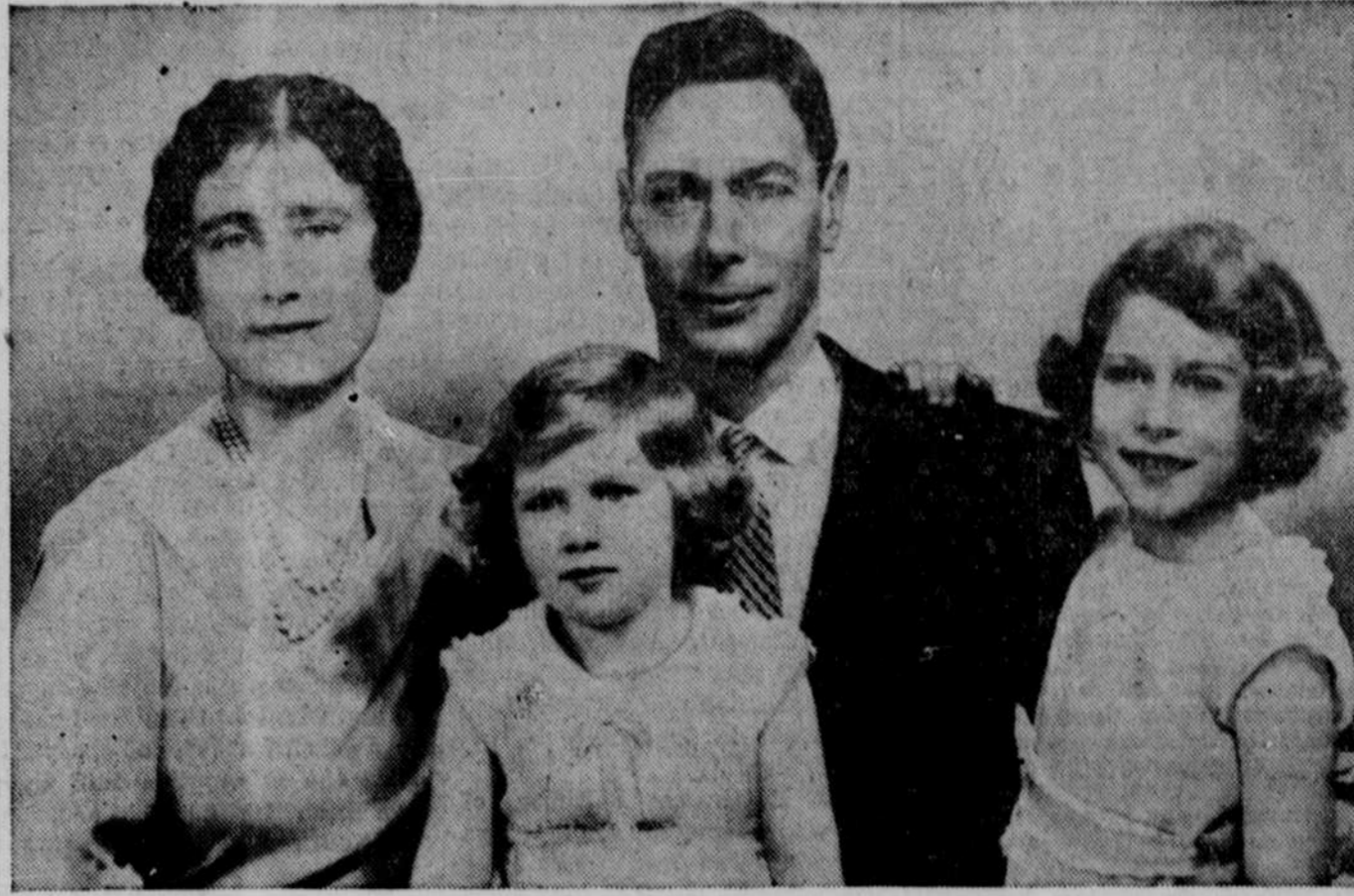
On the abdication of King Edward VIII, to marry Mrs. Wallis Simpson, his brother, the Duke of York, ascended the throne of England as George VI. It is expected the coronation will take place next June. Bringing a dispute which had brought the empire to a crisis, Edward voluntarily relinquished the throne. Photo shows King George with Queen Elizabeth and daughters, Princesses Elizabeth and Margaret Rose.