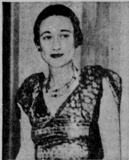
Mrs. Wallis Walford Simpson, for whom King Edward VIII abdicated the throne of England. Edward's romance with the former Baltimore beauty precipitated a government crisis before the monarch solved it by abdicating. Going into voluntary exile outside of the British Empire, the former king is expected to marry Mrs. Simpson as soon as her divorce decree becomes final. On the abdication of King Edward, his brother, the Duke of York, ascended the throne.