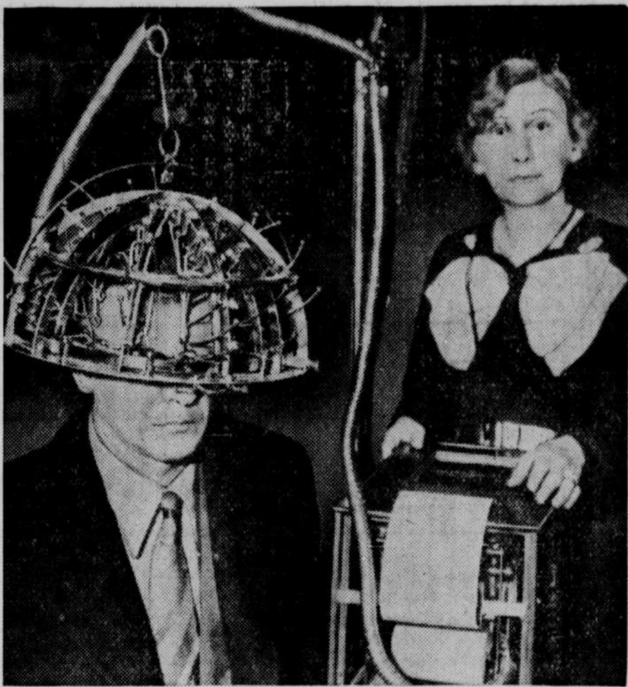
Like to learn all about your inhibitions and things? Get one of these birdcage affairs, demonstrated at the recent inventors' congress at Portland, Ore. According to the demonstrator it "instantly measures 32 relative areas of your brain."