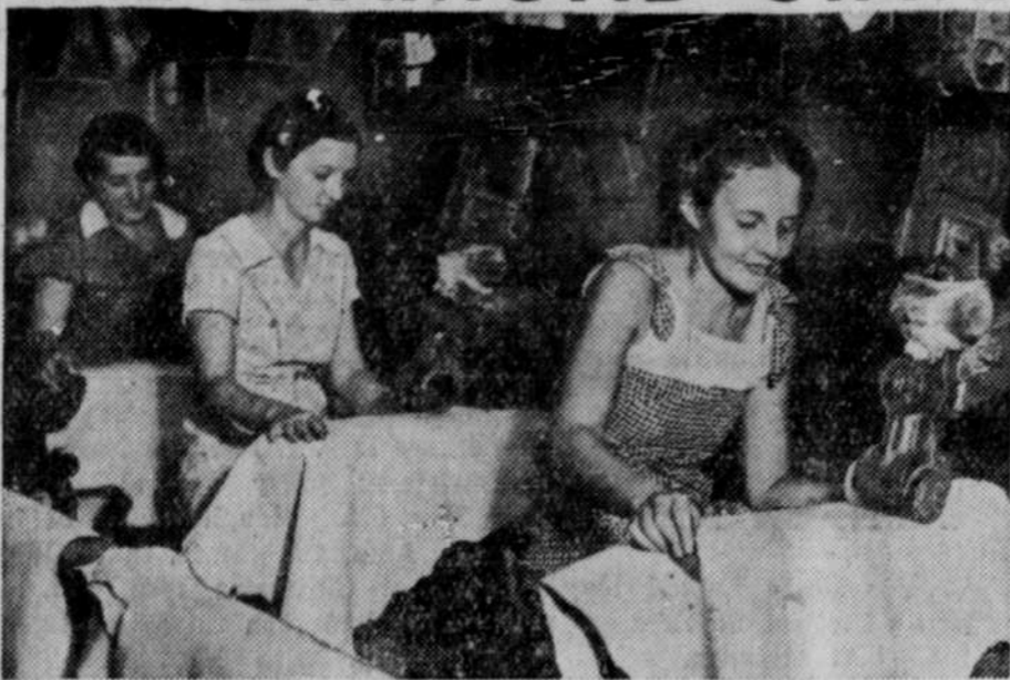
Delaware Girls Glazing Goatskins From India

Prepared by National Geographic Society, Washington, D. C.—WNU Service.