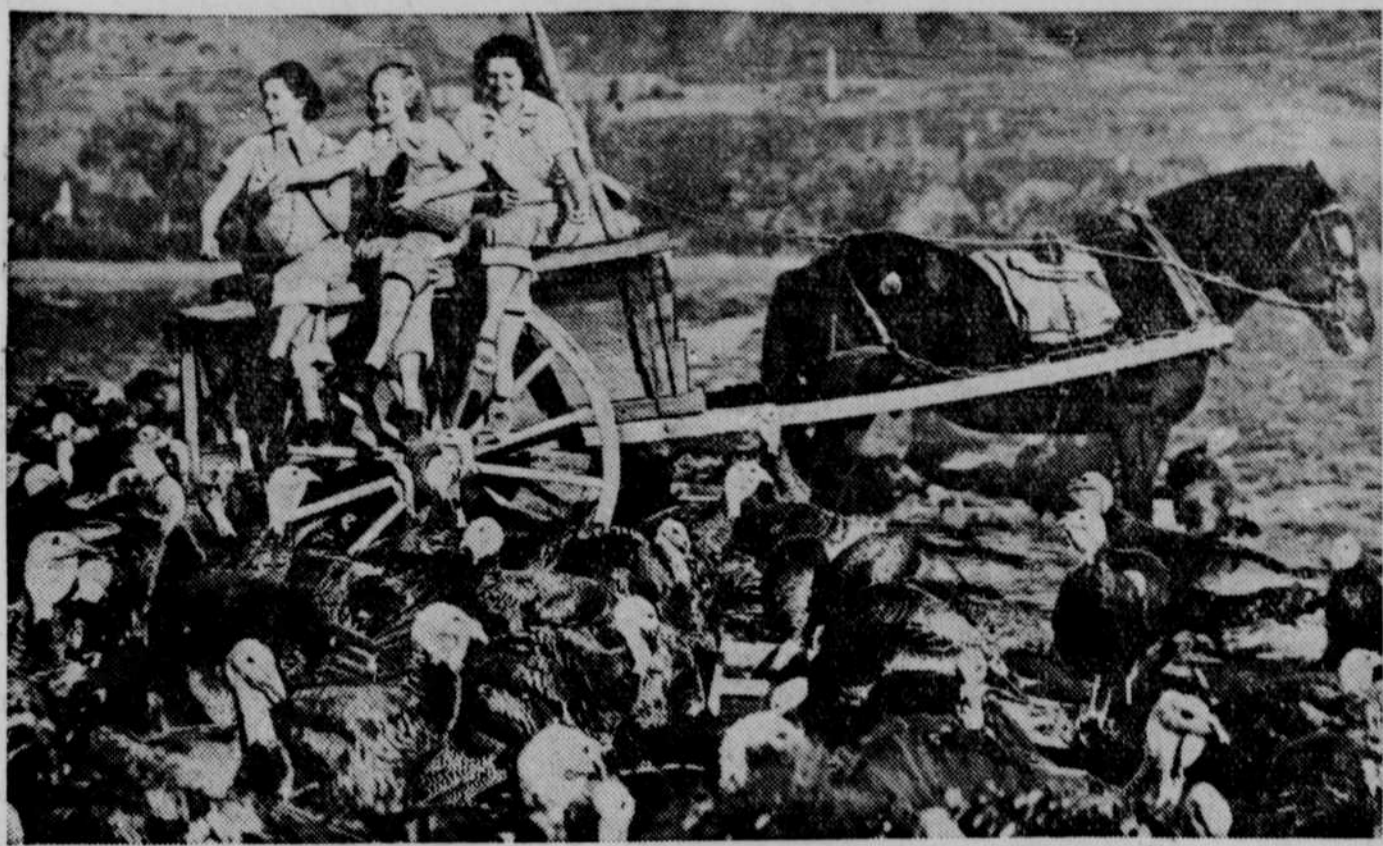
A million turkeys are being fattened by the Northwestern Turkey Growers in Utah who supply a great percentage of America's holiday birds. At this time each year, pretty Utah ranchettes help to feed and round up the choice birds which will soon grace Thanksgiving tables. Fair trio are seen feeding turkeys from the water wagon on a large Utah turkey ranch.