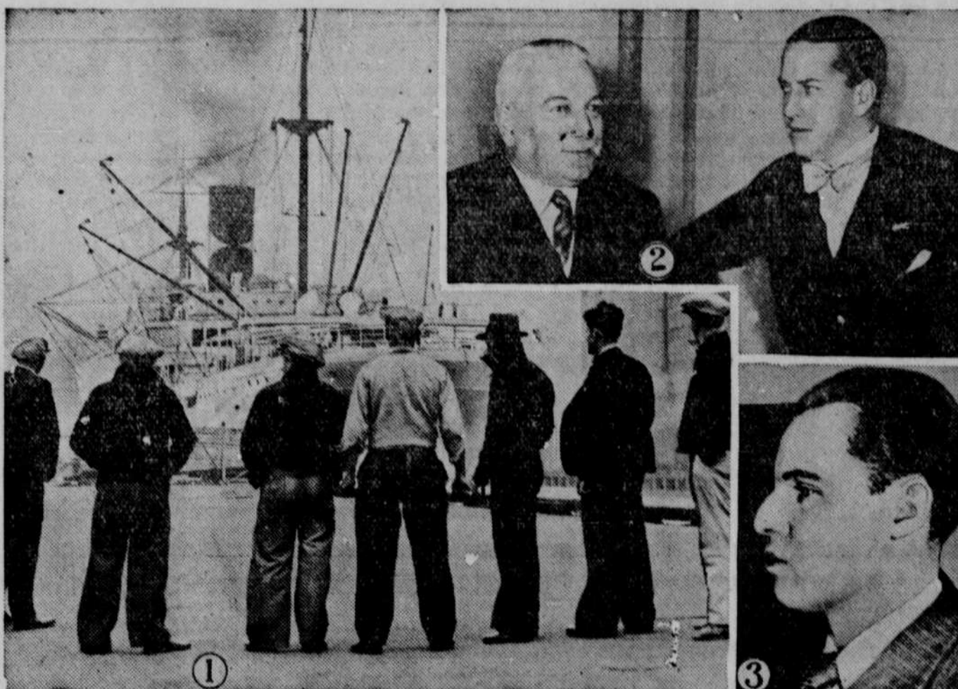
1—Picketers watching a freighter at San Francisco docks during the maritime strike which tied up the nation's shipping. 2—Baron Von Neurath, German foreign minister (left), shown conferring with Count Ciano of Italy during his recent visit to Berlin. 3—Leon Degrelle, so-called "Hitler" of Belgium, who was recently imprisoned, following the failure of a Fascist "putsch."