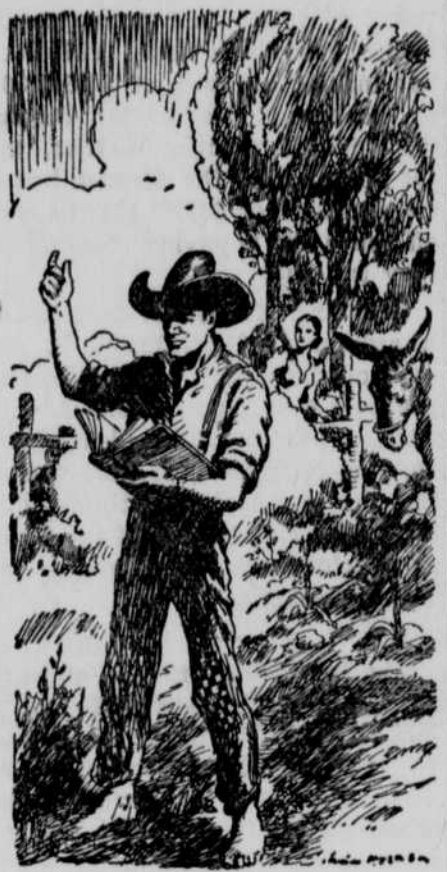
She Was Fascinated by His Zeal and the Reality of the Performance.