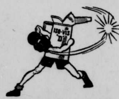
One... Staying Power