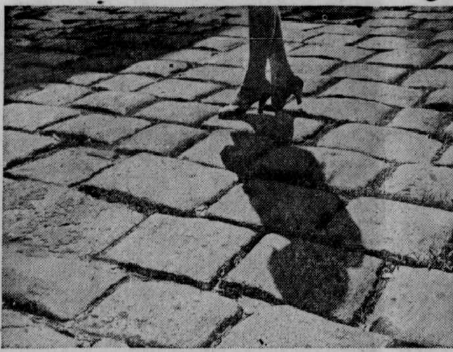
Many New Orleans' Paving Stones Came From Europe.

Prepared by National Geographic Society, Washington, D. C.—WNU Service.