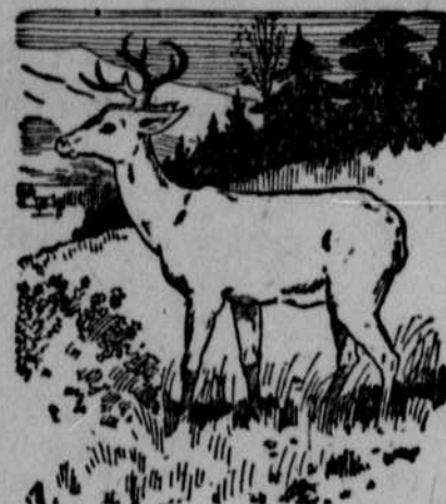
Lightfoot Listened and Watched.

In the case of Buster Bear and Danny, the latter had simply to keep out of reach of Buster. As long as Buster didn't get his great paws on Danny the latter was safe. Then, too, Danny is a very small person. He is so small that he can hide under two or three leaves. Wherever he is he is pretty sure to find a hiding place of some sort. His small size gives him advantages in a game of hide and seek. It cer-