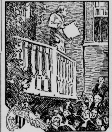
Reading Declaration of Independence From Balcony of State House.

The idea of a declaration of independence had its birth 15 years prior to July 4, 1776. James Otis, the "first-tongued orator," sounded the first note in the statehouse at Boston, in 1761. Nearly a month before the writing of the formal declaration, "Richard Henry Lee, as spokesman for the Virginia delegation in congress, introduced his resolution which, so far as the record was concerned, finally became the formal declaration. It precipitated a serious debate, for there were