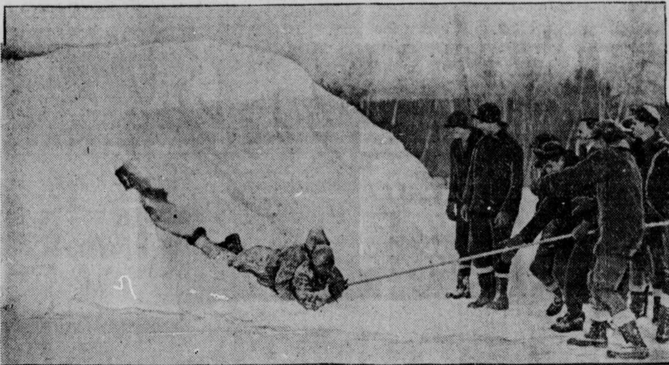
These recruits of the One Hundred Seventeenth company of the Civilian Conservation corps of Tamworth, N. H., are shown getting a snowy bath as they are hauled through a 12-foot snow bank. This was their penalty for losing a tug-o'-war to the regulars of the company, during the winter sports program enjoyed by the campers.