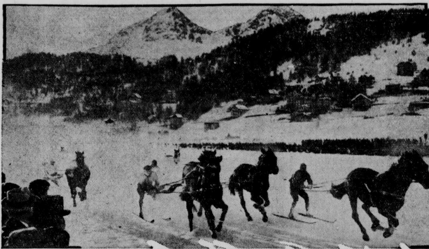
Devotees of winter sports in Switzerland get a lot out of ski-joring, which is a combination of horse racing and skiing. It is fast and exhilarating, and also it offers opportunity to those who like to place a bet now and then.