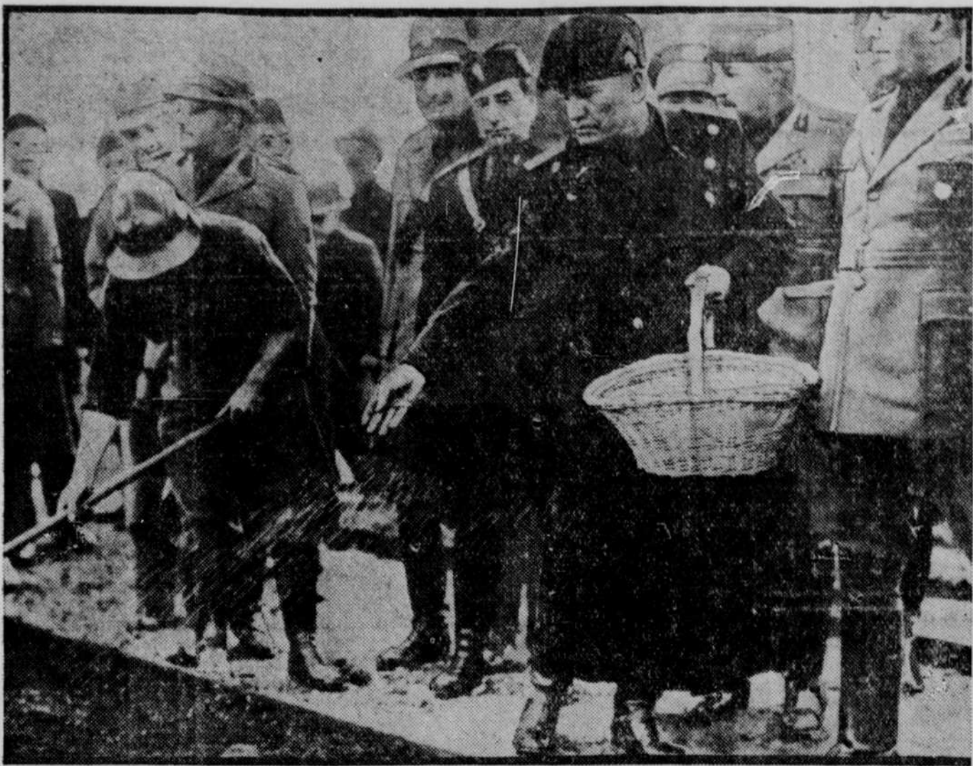
One of the pet projects of Premier Mussolini is the development of that section of Littoria which was made into farmlands after being reclaimed from the Pontine marshes. During a tour of the province he showed his skill in agricultural arts by sowing corn seed on some newly turned soil.