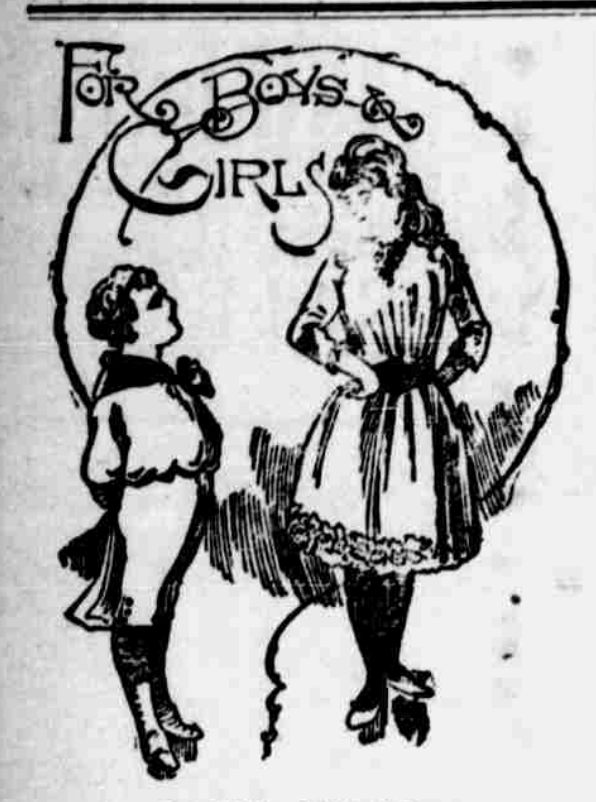
In Little Folks' Eyes.

How strange it would be if the pixies came