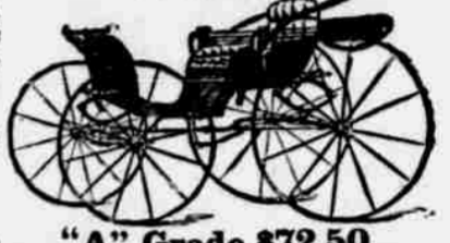
"A" Grade $72.50