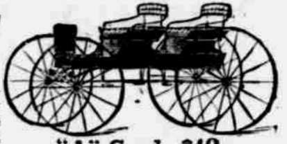
"A" Grade $40.

BUGGIES, WAGONS, SURRIES, ROAD CARTS, HARNESS, SADDLES. SALESROOMS AND FACTORY: Sycamore and Canal Sts.,