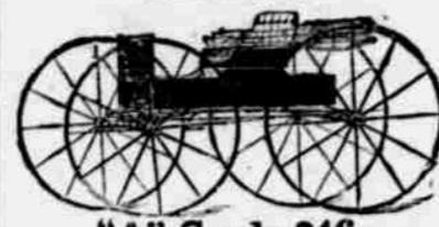
"A" Grade $46.

ALLIANCE CARRIAGE CO., CINCINNATI, OHIO.