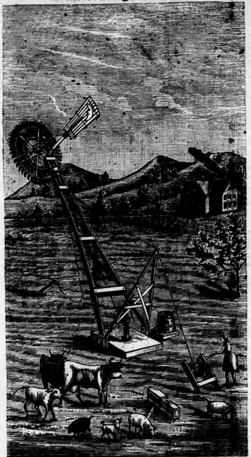
The "Addis" Mill and Two-Post Hinged Tower being lowered for the purpose of oiling or placing it out of the reach of the storm. It can be raised and lowered by a child.

If you want a mill or stock waterer send for our illustrated catalogue, terms and prices, and if our goods are not for sale by your local dealers we will make special introductory terms for the first mill or waterer ordered in any locality.