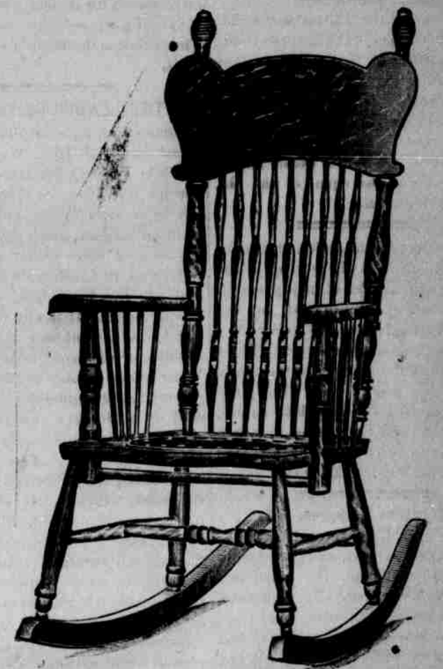
A pretty Rocker for the parlor. This tasty Parlor Rocker, either in curly birch, antique oak or mahogany finish, cobbler seat, only $3.25.