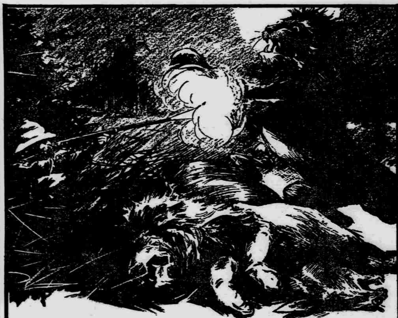
WITH A SAVAGE SNARL HE CHARGED DIRECTLY AT THE THICKET WHERE I WAS CONCEALED.

I have once or twice sat up over a dead animal. This way of getting lions is only likely to be successful when there are many hyenas about, as they make such a noise that they will attract any lion that may come past within a reasonable distance.