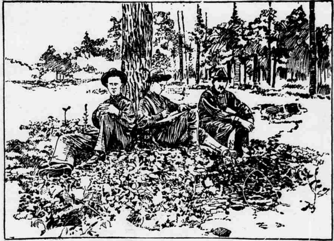
"WRITING HOME TO MOTHER." A familiar scene at Chickamauga.

Capt.-Gen. Blanco has apparently not yet abandoned the hope of luring the American warships within range of the Havana batteries. He tried it again on Friday morning last, but with no better success than in his previous attempts. Ad-