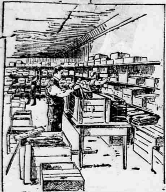
PUTTING UP GOODS FOR THE ARMY.

Admiral Sampson has again assured the Navy Department that the Spanish fleet is all in Santiago harbor. He leaves no doubt about the presence of all the ships. None escaped to account for the "spook" ships that have been sighted in different parts of the West Indies. The Spanish Government has sent out many false advices to the effect that only a part of the fleet is in Santiago harbor. Sampson denies these reports. He is now certain that he has the whole fleet securely caged and that it cannot escape. "Lieut. Blue has