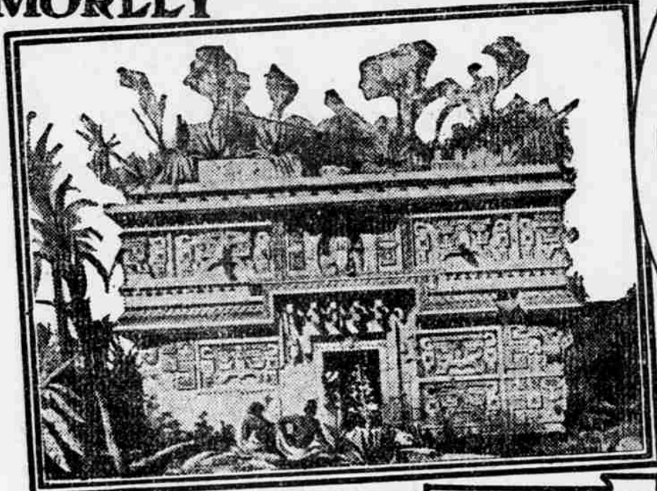
END VIEW OF THE MONJAS OR MONASTERY

Chichen Itza today is somewhat changed in appearance from the time when pilgrims came from far and near to appease with human sacrifice the wrath of offended deities. Now the city lies buried in a thick jungle, which has steadily won its way into the very heart of the holy place. Colonnades have been overthrown and pyramids covered with trees to their summits; courts have been lost in a tangle of thorn and creepers; and palaces stripped of their sculptured embellishment. Desolation has spread everywhere in the wake of the encroaching vegetation.