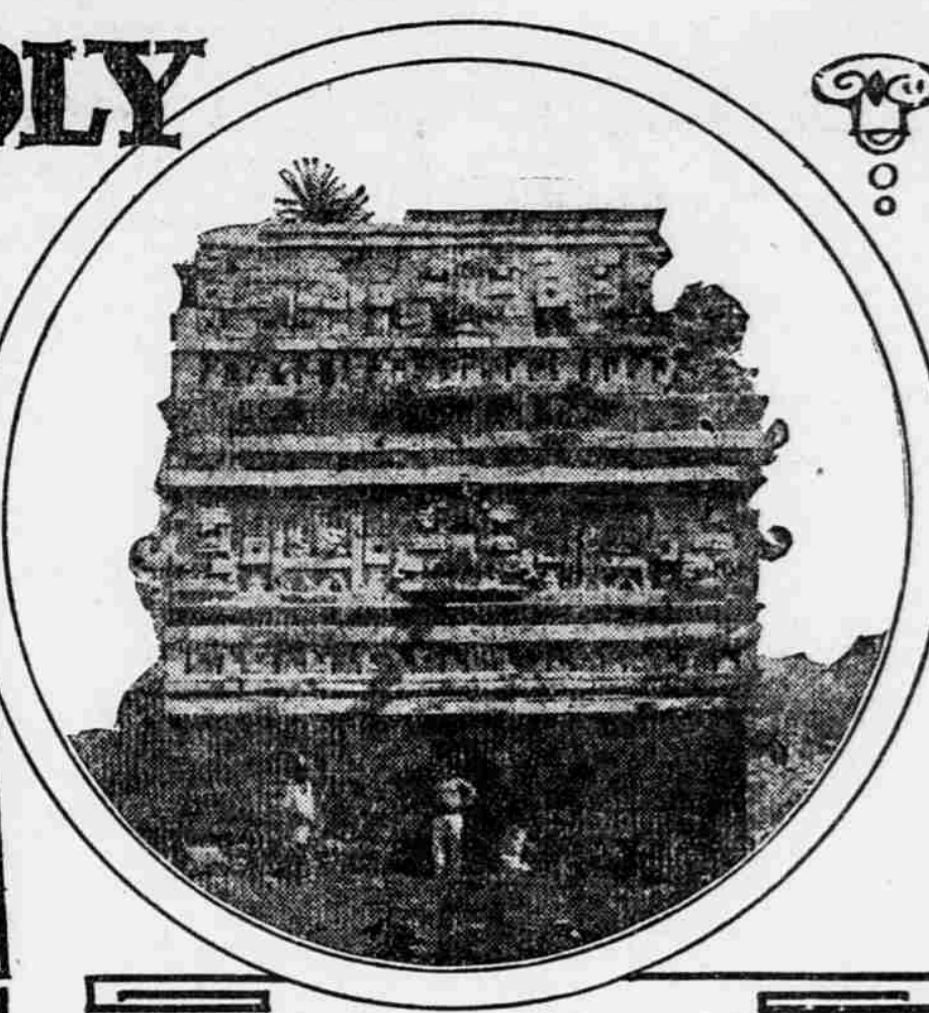
BUILDING CALLED THE IGLESIA, OR CHURCH