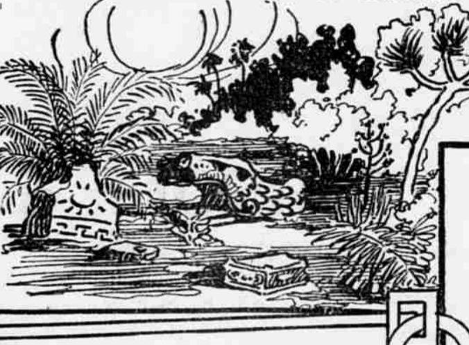
VIEW OF TEMPLE CALLED CHICHANCHOB