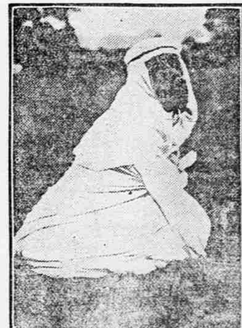
HOW DOGS ARE USED BY THE MOORS TO DRAW THE SPANISH FIRE.