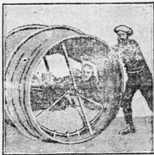
ROLLING AROUND THE WORLD.

When that mode of covering the globe became more common some venturesome pedestrians started to walk the distance, and intense interest was also taken in these journeys. Now we have an around the world journey that for novelty surpasses anything of the kind ever before undertaken. This is the tour of two Italians, who propose to cover the distance with a barrel, one