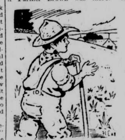
"Dad must want me to do something for him up in the barnyard," thought Farmer Brown's Boy.

came from. It sounded as if it might have come from out near the henhouse. He whistled a reply and hurried out and over to the henhouse. Farmer Brown wasn't there. Such a puzzled look as the freckled face of Farmer Brown's Boy wore. He whistled twice, but he received no reply. Then he looked more puzzled than ever. He went over to the house to see if Farmer Brown was there. He