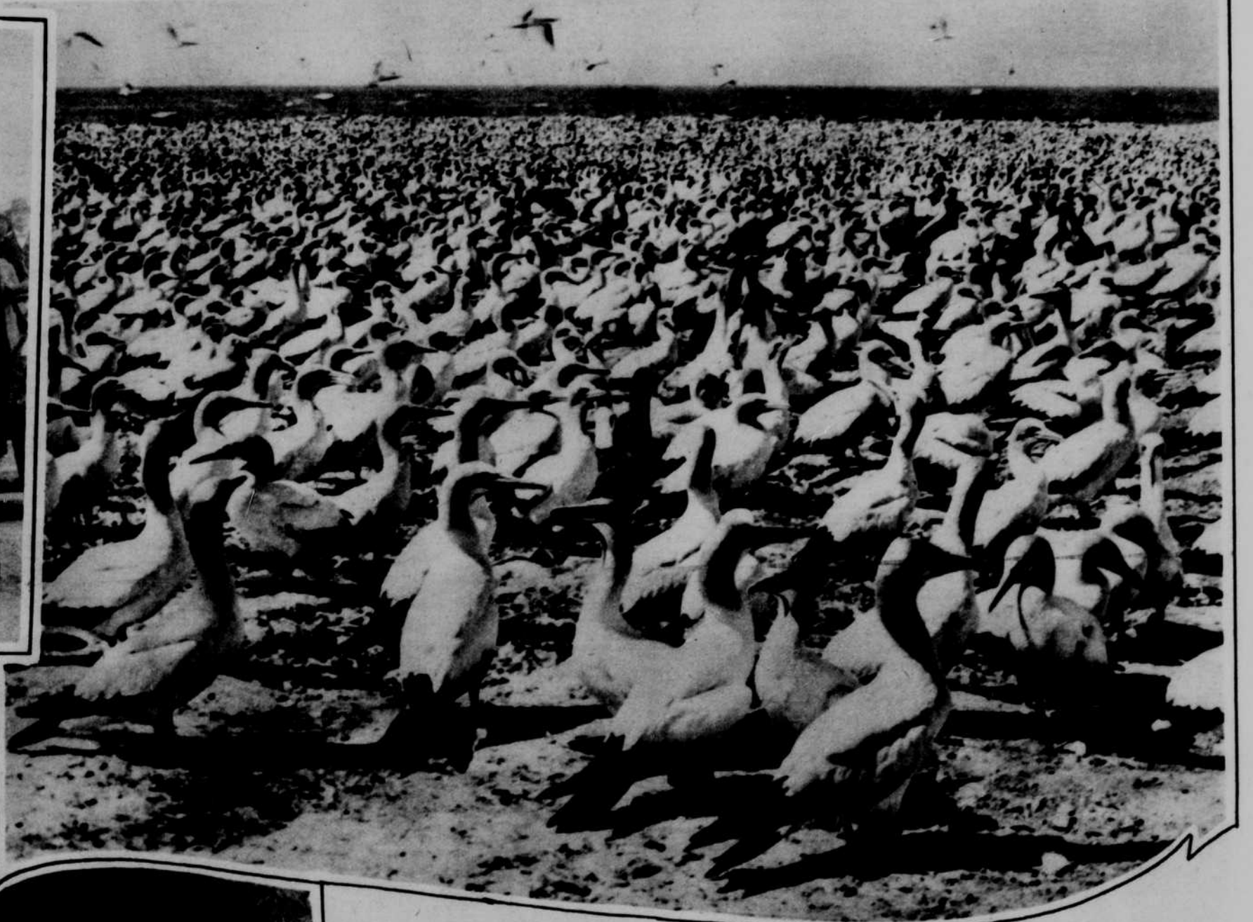
A sea of birds. What a happy hunting ground for sportsmen is shown in this striking view of Bird island, a lonely bit of land in Algoa bay, 40 miles from Port Elizabeth, South Africa, showing a veritable sea of malgas basking in the sun and enjoying seashore life.