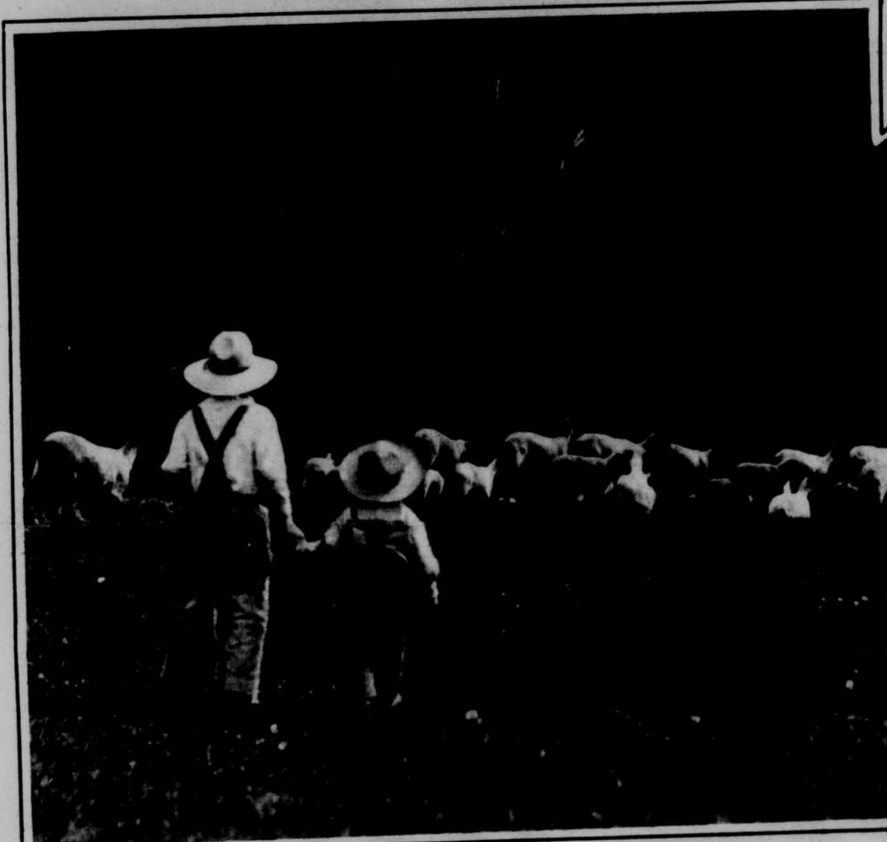
A pastoral masterpiece. A scene more typical of the age of fairy tales and bucolic ideals of the 18th century than the 20th century when youngsters of this age consider lamb in the spring incomplete without mint sauce and green peas.