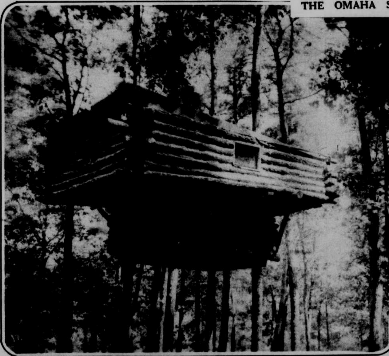
A modern "summer home" built by a group of boys on the shore of Lake Osakis, Minnesota, whose plan of construction makes it safe from almost any form of attack.