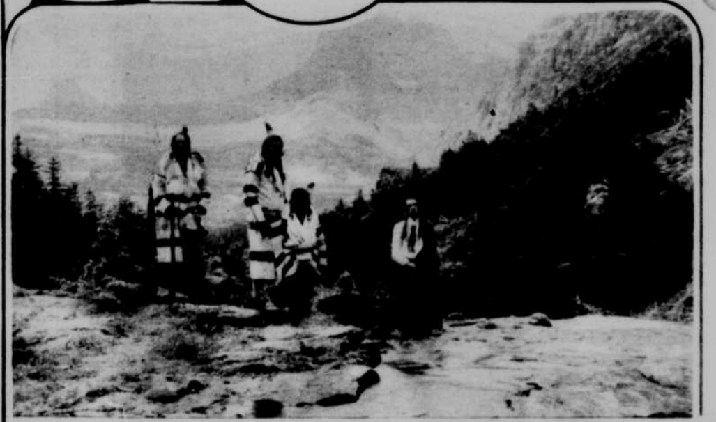
Blackfeet Indian chiefs of the Glacier National Park Reservation attend the medicine man of the tribe when he stands in the running stream to commune with the great spirit.