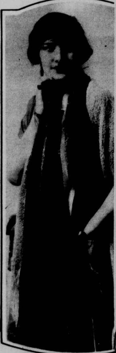
A smart new knitted scarf with deeply fringed ends. Kohler and Herbert.