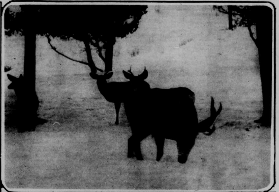
The mule deer of Yellowstone National Park always attract attention.