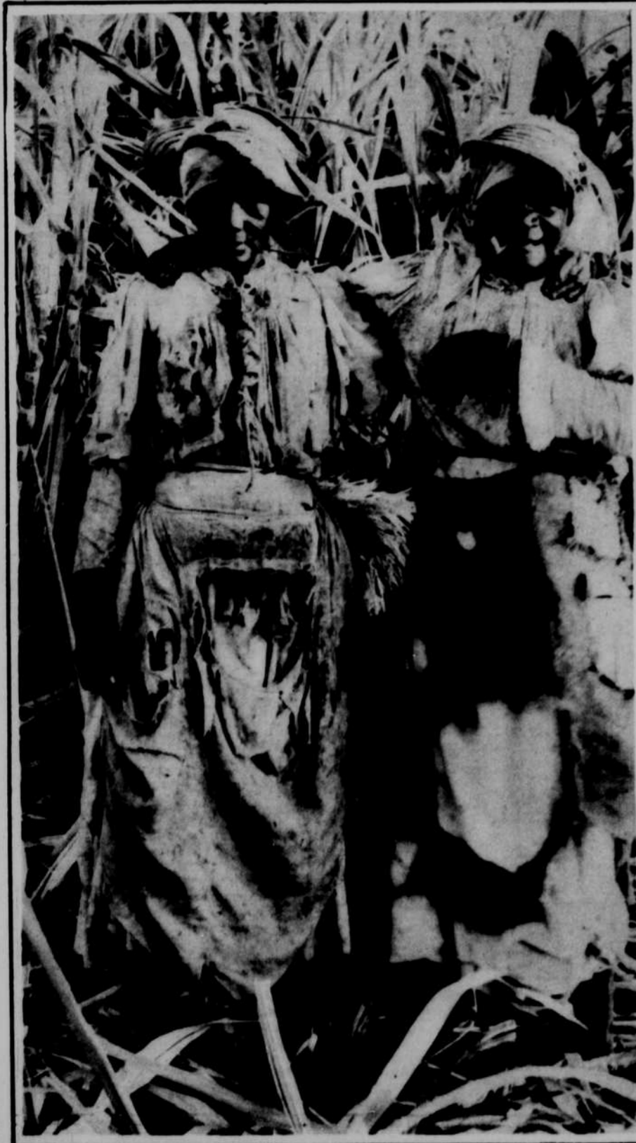
"Sport clothes" as they are worn by the younger set of the Mille Lacs, Minnesota. Chippewa tribe of Indians.