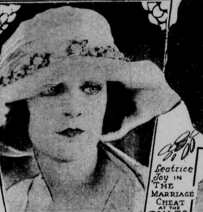
Leatrice Joy in "THE MARRIAGE CHEAT" AT THE RIALTO

Percy Marmont enacts the missionary who is denied even one kiss from the fair Octavia and Adolphe Menjou appears as Bob Canfield, the husband,