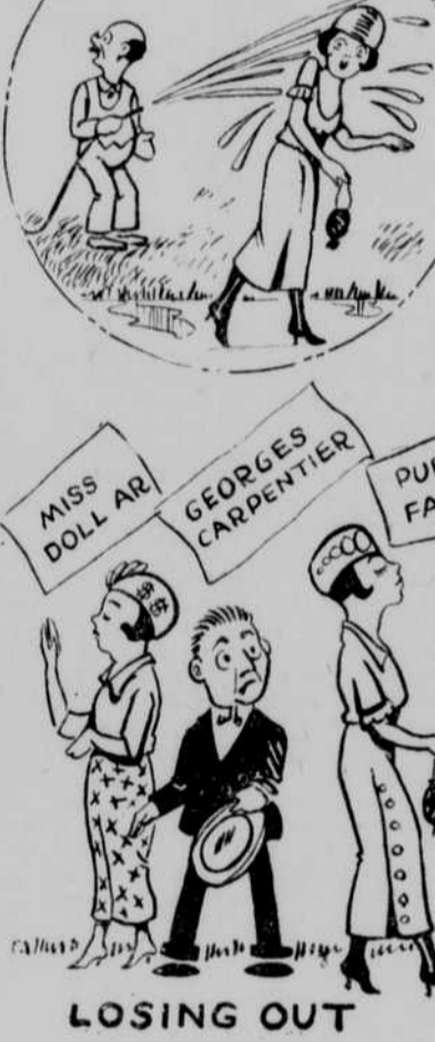
MISS DOLLAR GEORGES CARPENTIER PUBLIC FAVOR

IT'S FINE STUFF AND ALL THAT WHAT I WANT TO DO IS GET FAT, BUT IT'S LIABLE TO MAKE ME THIN.