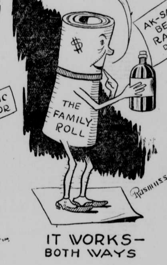
IT WORKS—BOTH WAYS

IT'S FINE STUFF AND ALL THAT WHAT I WANT TO DO IS GET FAT, BUT IT'S LIABLE TO MAKE ME THIN.