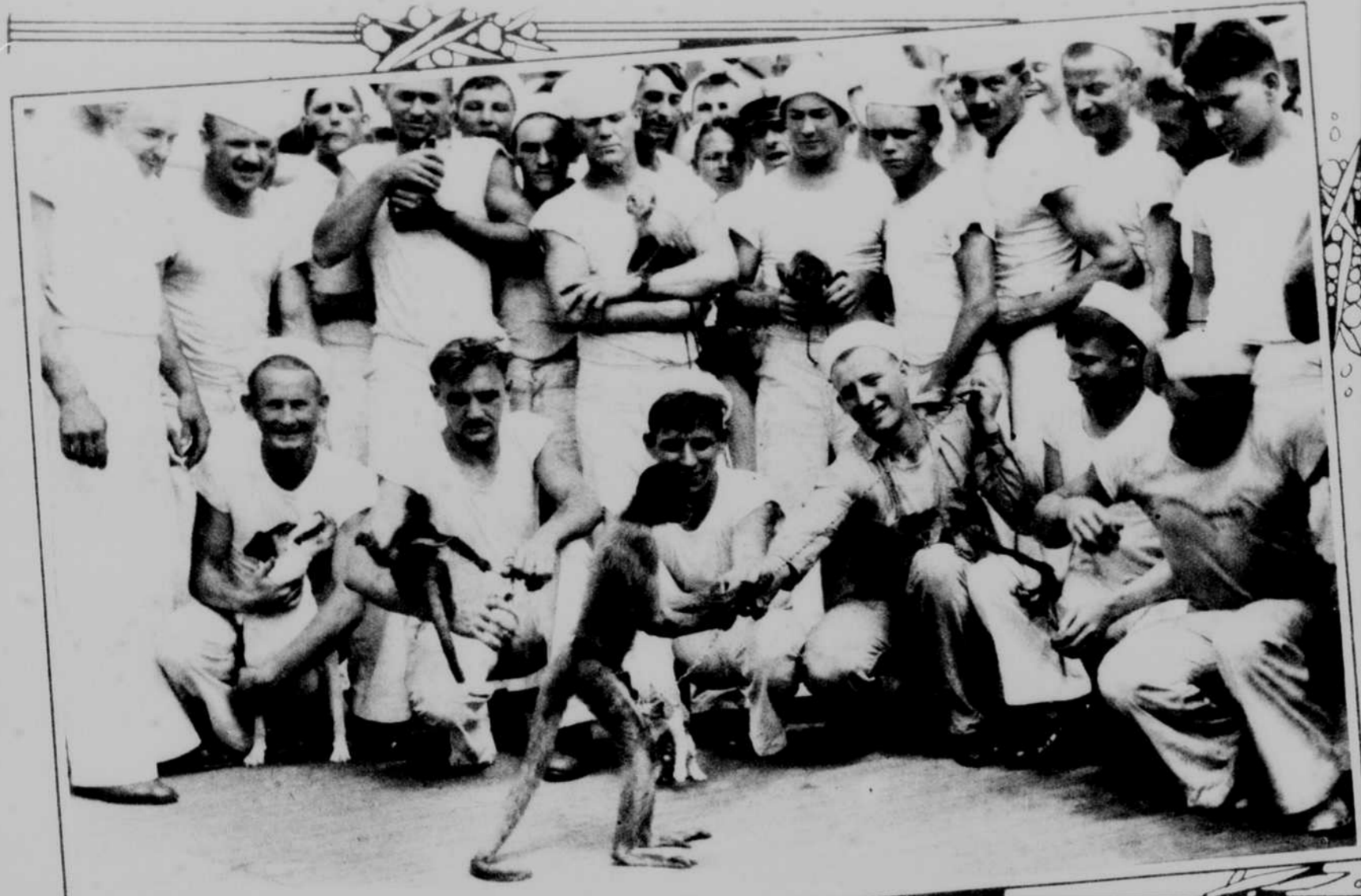
Mascots on board the U. S. S. Wyoming now in Pacific waters taking part in the joint maneuvers of the Atlantic and Pacific fleets. These animals from various climes find excellent berth in the U. S. Navy and aid the Navy men in moments between their manifold duties.