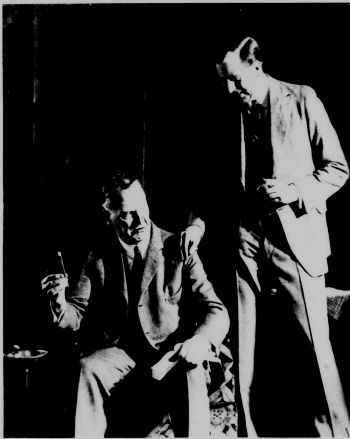
"—he was making a face like a horse chewing briars"

Dr. Scholl's Zino-pads "Put one on—the pain is gone"