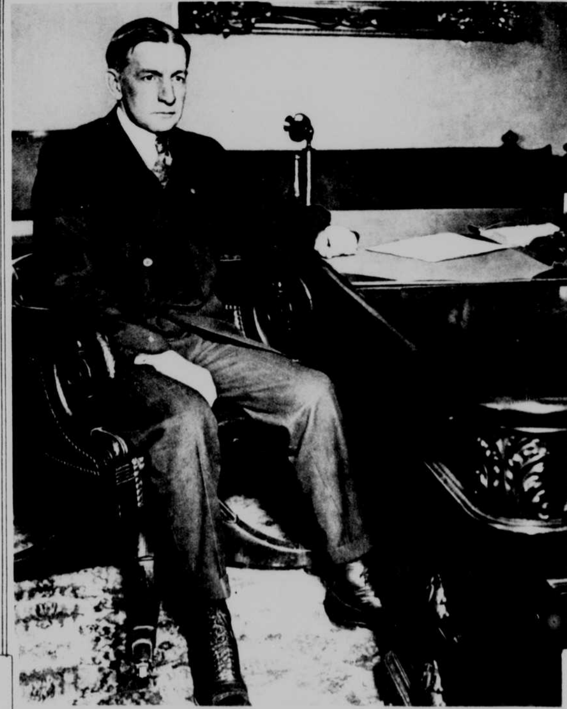
Vice President Charles G. Dawes in his office at the Capitol.