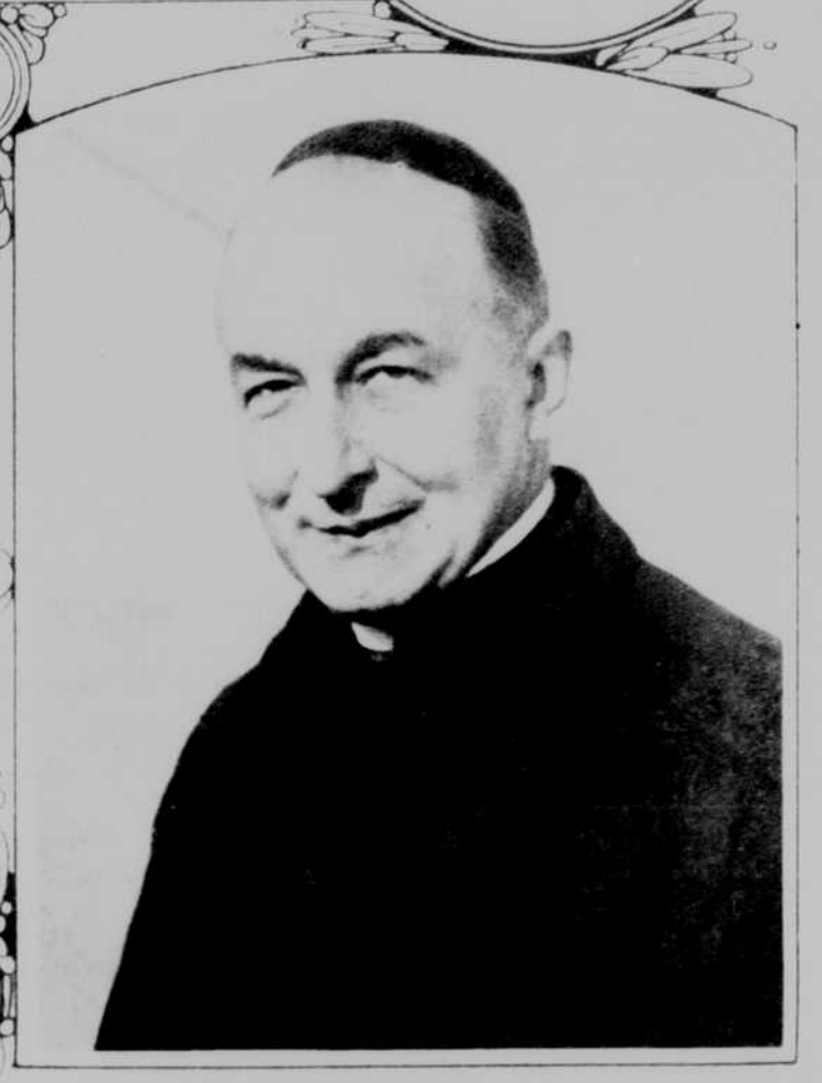
Cardinal Mundelein of Chicago, returns from Rome on S. S. Berengaria. He arrived in New York, recently. He brought with him completed plans for the Eucharistic Congress to be held in Chicago next year. Cardinal Mundelein returns to the United States from his Holy Year pilgrimage to the "Holy City."