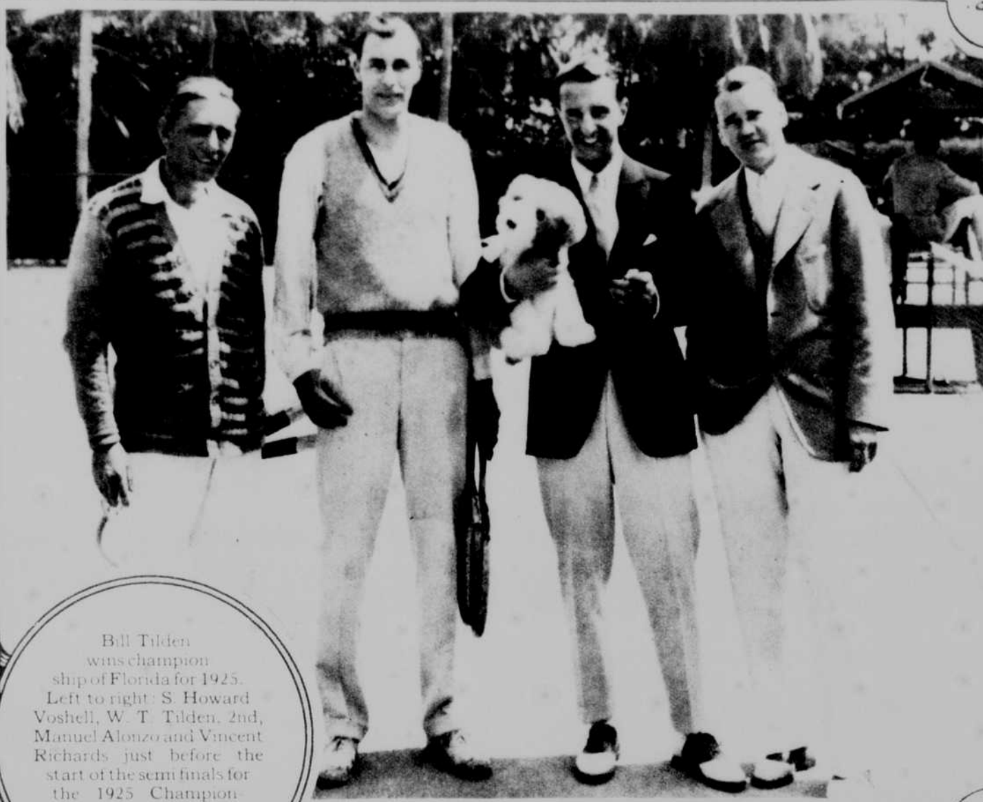
Bill Tilden wins champion ship of Florida for 1925. Left to right: S. Howard Voshell, W. T. Tilden, 2nd, Manuel Alonzo and Vincent Richards just before the start of the semi-finals for the 1925 Championships of Florida.