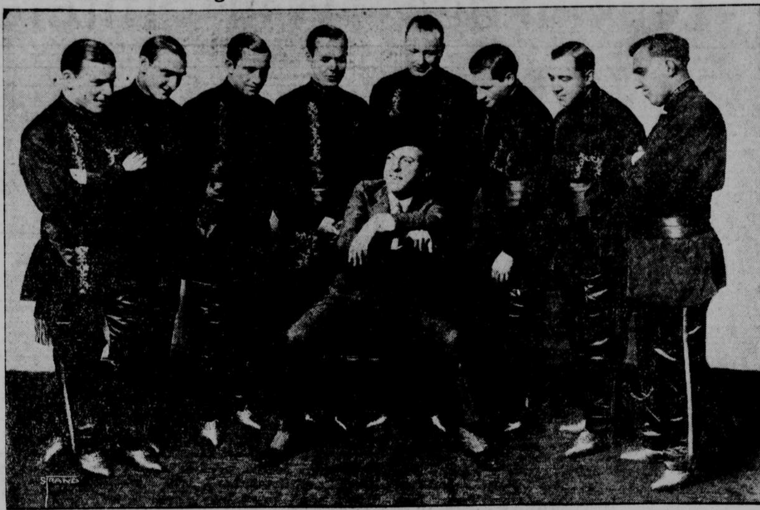
N. V. A. week is a week of celebration in the vaudeville theaters of America. That's the week the National Vaudeville Artists association takes up a collection in the vaudeville theaters to raise funds for its charitable enterprises.