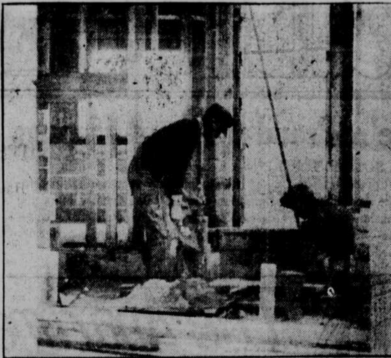
A fireplace, to be a comfort in a home, must be properly constructed. Two of the reasons from the Diamond Concrete Products set the one in The Omaha Bee home and guarantee that it's right.