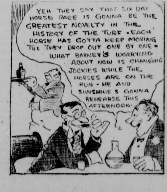
Drawn for The Omaha Bee by Billy DeBeck