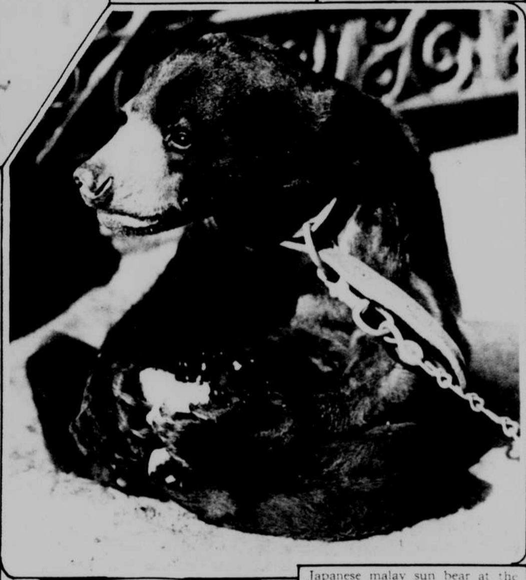
Japanese malay sun bear at the Boston Zoo.