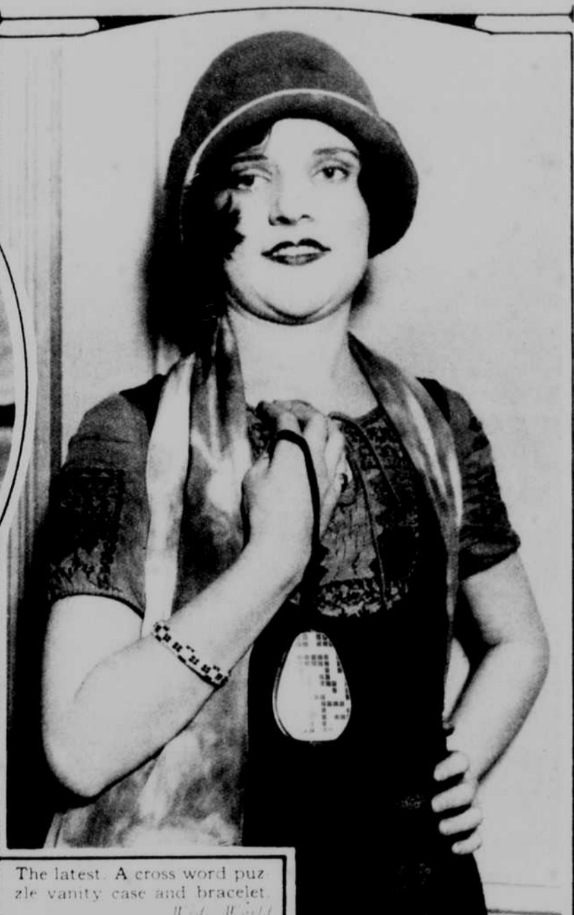
The latest. A cross word puzzle vanity case and bracelet.