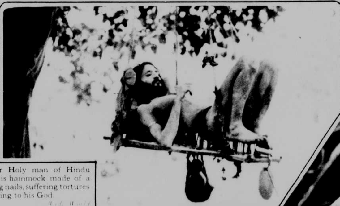
Right. A Sadoo or Holy man of Hindu India, reclining in his hammock made of a plank with projecting nails, suffering tortures in silence as an offering to his God.