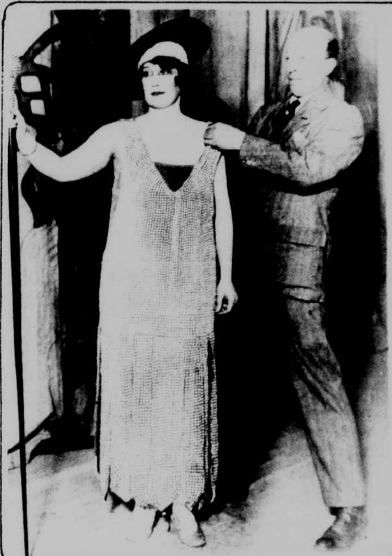
This frock made of 23,000 imitation diamonds weights forty eight pounds and requires the aid of a man to carry it about. The gown was made in Birmingham, England and costs about $650.