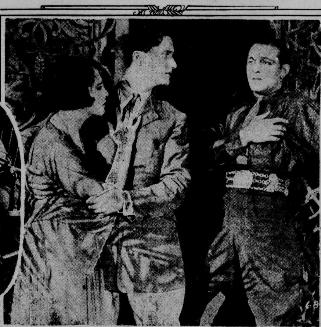
Bebe Daniels, James Rennie and Ricardo Cortez in "Argentine Love" at the STRAND